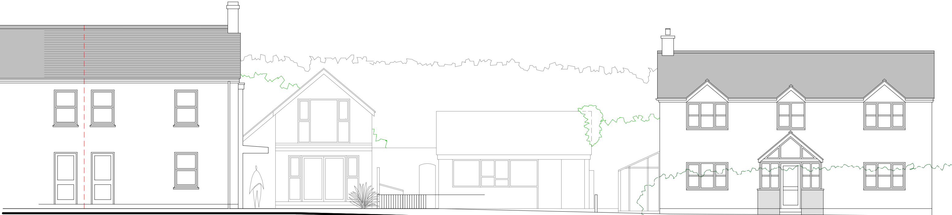
Proposed SW Elevation