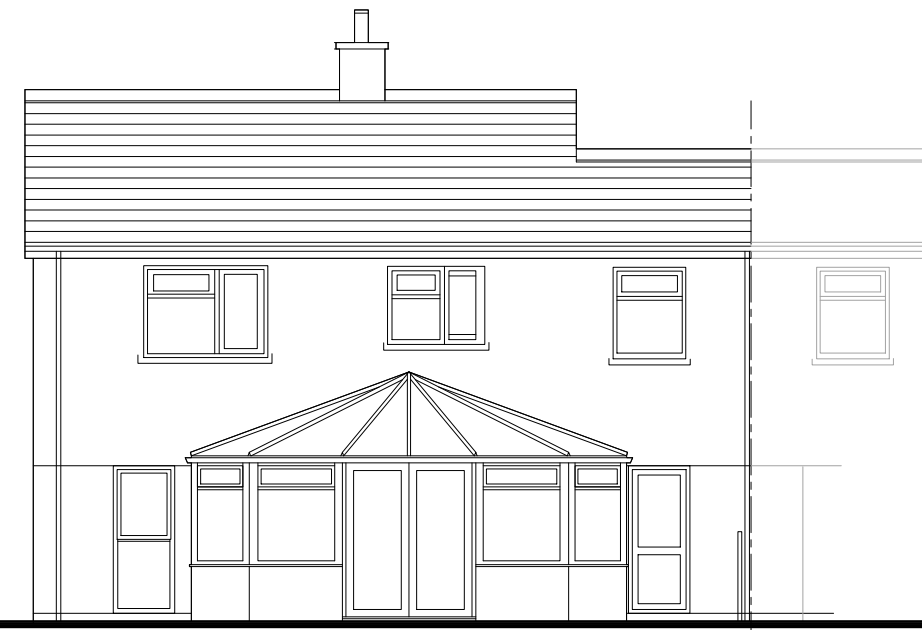
REAR (NORTH) ELEVATION