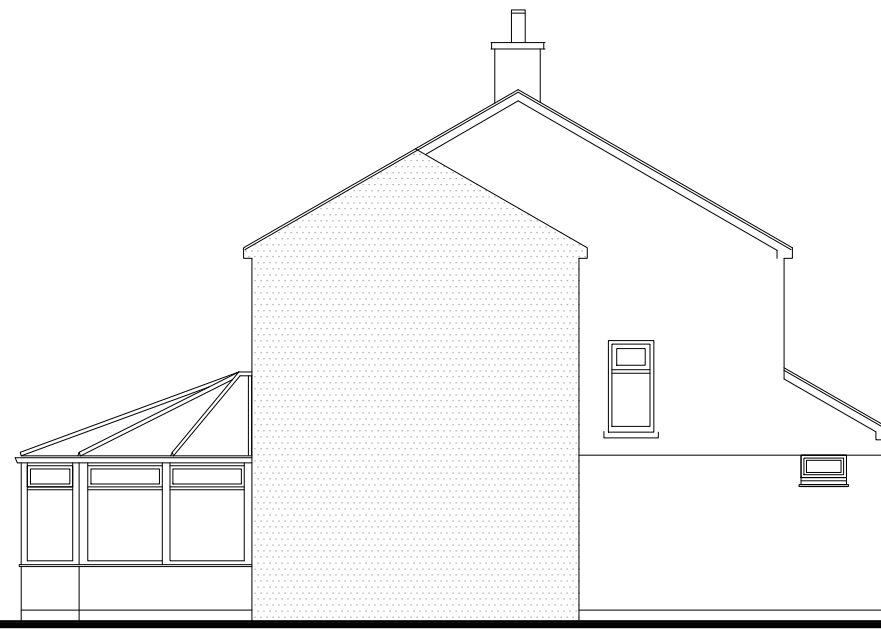
SIDE (WEST) ELEVATION