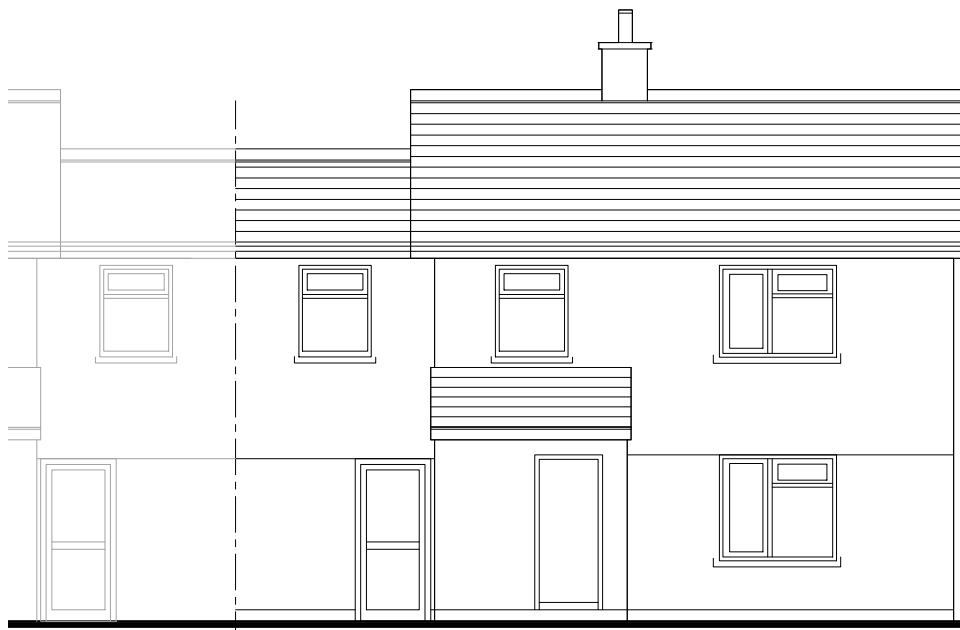
FRONT (SOUTH) ELEVATION