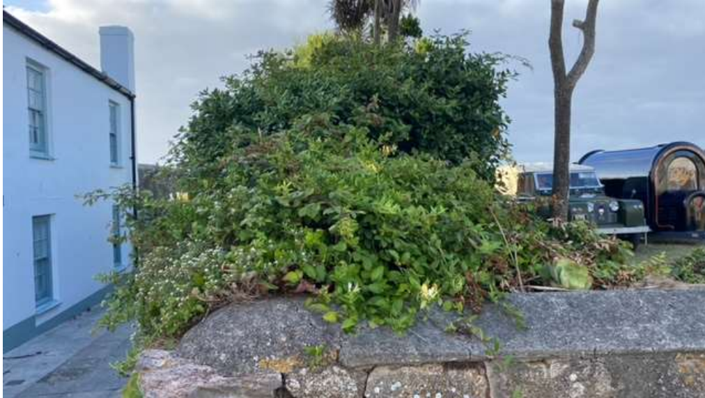
Photo showing how closely the land rover with generator is sited to residential windows.