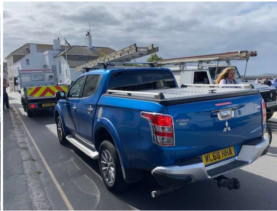
(left – the land rover and trailer block highway in both directions while driver places wood by kerb.) (right - cyclist weaves through backed up traffic)