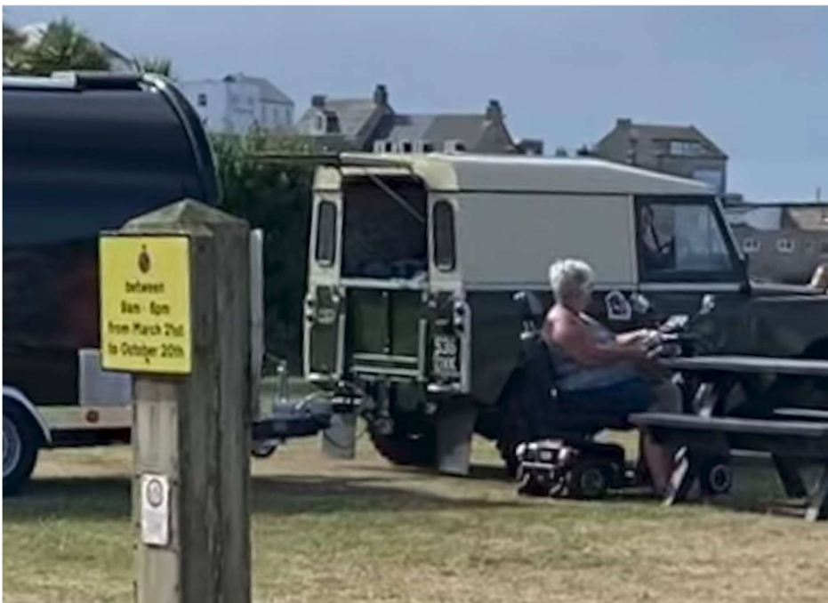
The enlarged section shows how close the vehicle and trailer must pass to public users of Holgate's Green (here, someone using a mobility vehicle).