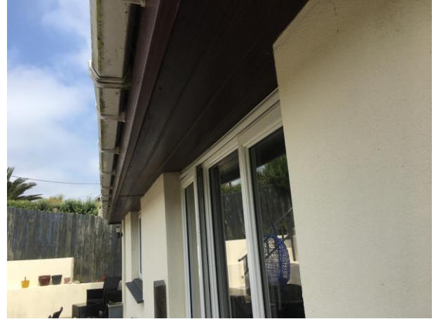
Photograph 2: Showing the tight fit of the uPVC soffits with guttering attached at the eaves of the western pitch. The high quality of the render and tightly fitted windows frame on this aspect can also be seen.