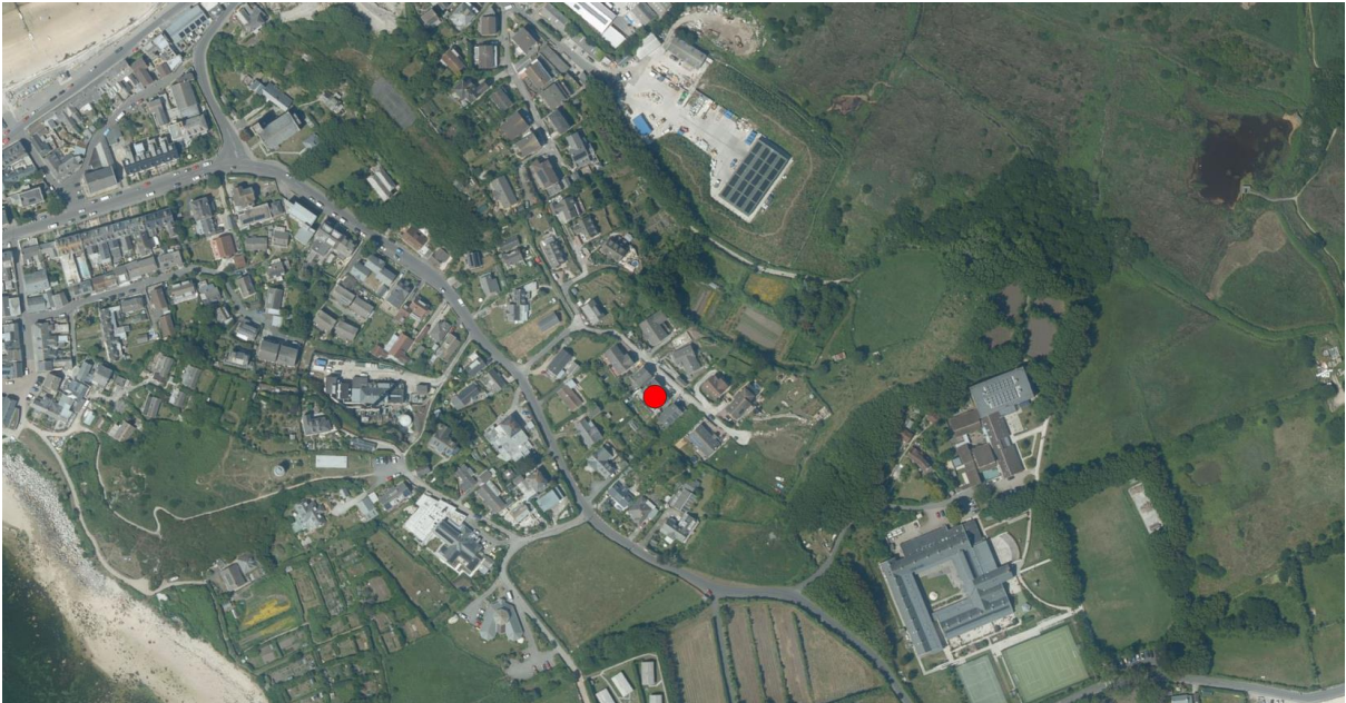
Map 01 – Illustrating the location of the property within the local environs (red circle). Reproduced in accordance with Google’s Fair Use Policy.