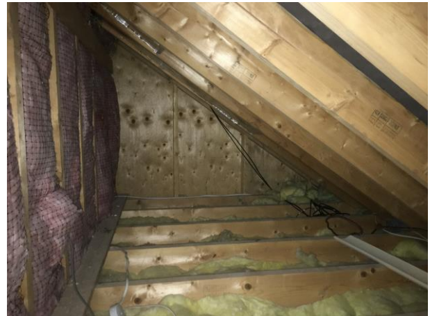
Photograph 4: Showing the interior of the void which runs along the western eaves of the roof.