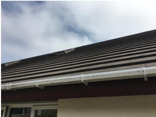
Photograph 3: Showing the tightly-fitted interlocking pre-fab roof tiles on the western pitch of the roof.