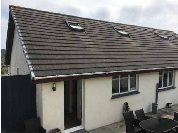
Photograph 1: Showing the building viewed from the north-western corner – this is the western pitch of the roof which would be impacted by the proposals.