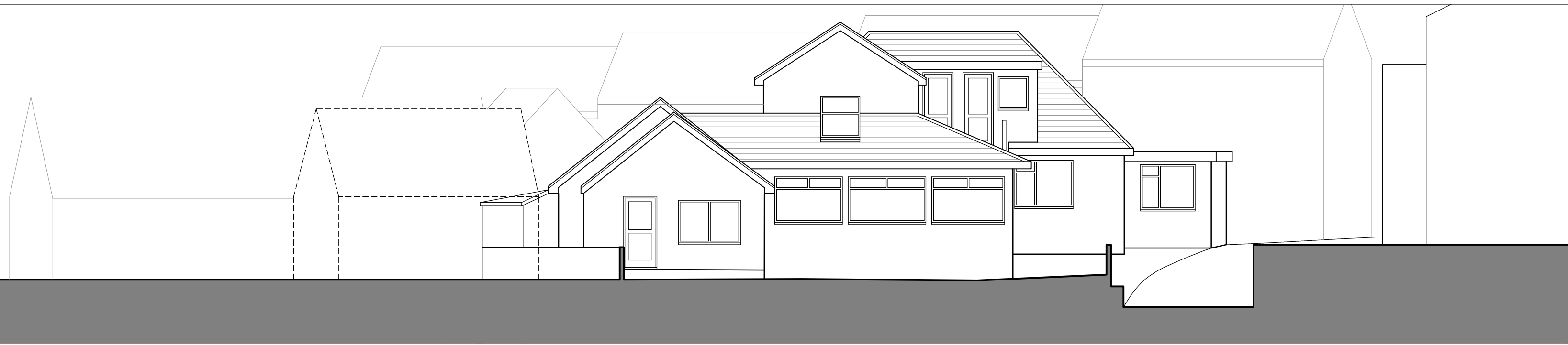
01 Existing South Elevation 1:100