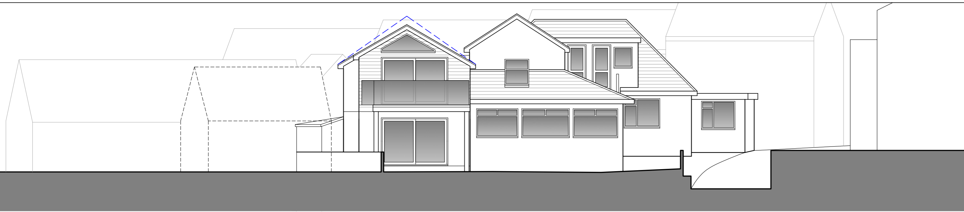
01 Proposed South Elevation 1:100