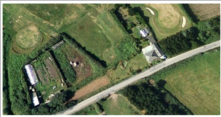
2005 Aerial View

RECEIVED By Lisa Walton at 10:30 am, Sep 29, 2023