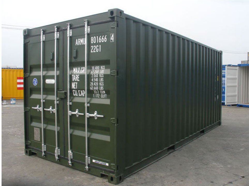
Similar container for reference