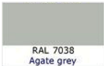
Colour of containers