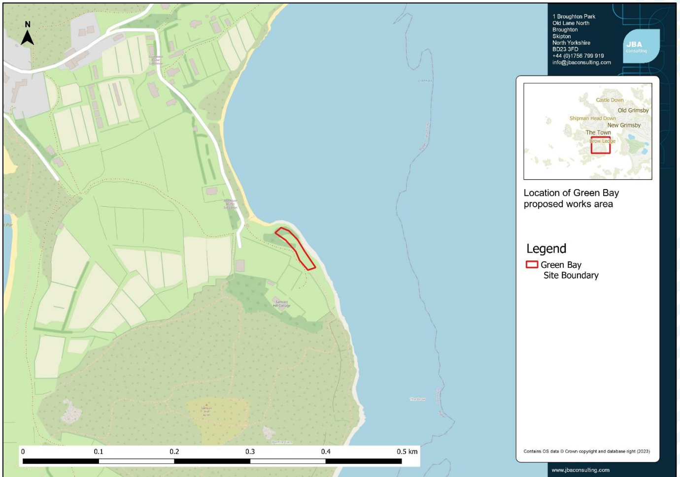
Figure 3-1: Location of proposed scheme

Green Bay is located on the east coast of the island of Bryher, approximate central OS Grid Reference SV 87946 14537. The beach comprises of sand and cobble with a well-established vegetated crest. Green Bay has a sheltered orientation within Tresco Sound and is not subject to significant wave action. The location of the proposed scheme can be seen in Figure 3-1.