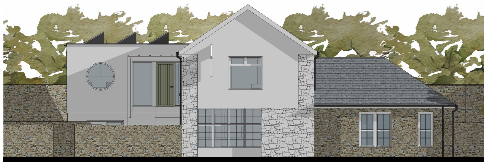
PROPOSED NORTH EAST ELEVATION (ROADSIDE) | 1:100