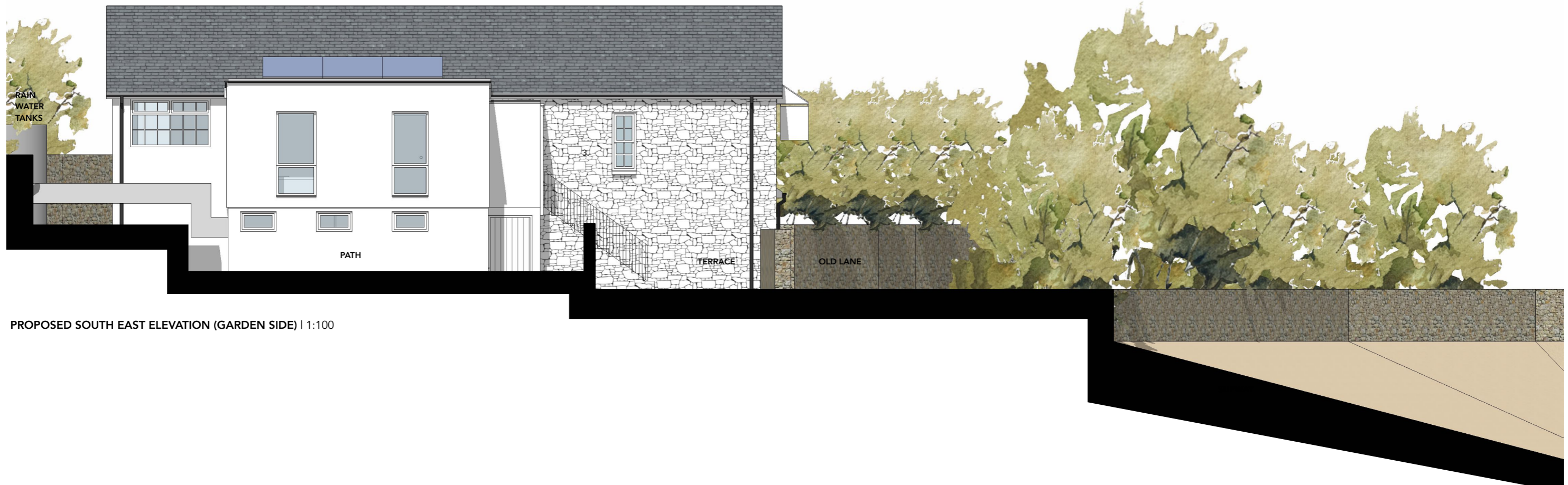
PROPOSED SOUTH EAST ELEVATION (GARDEN SIDE) | 1:100