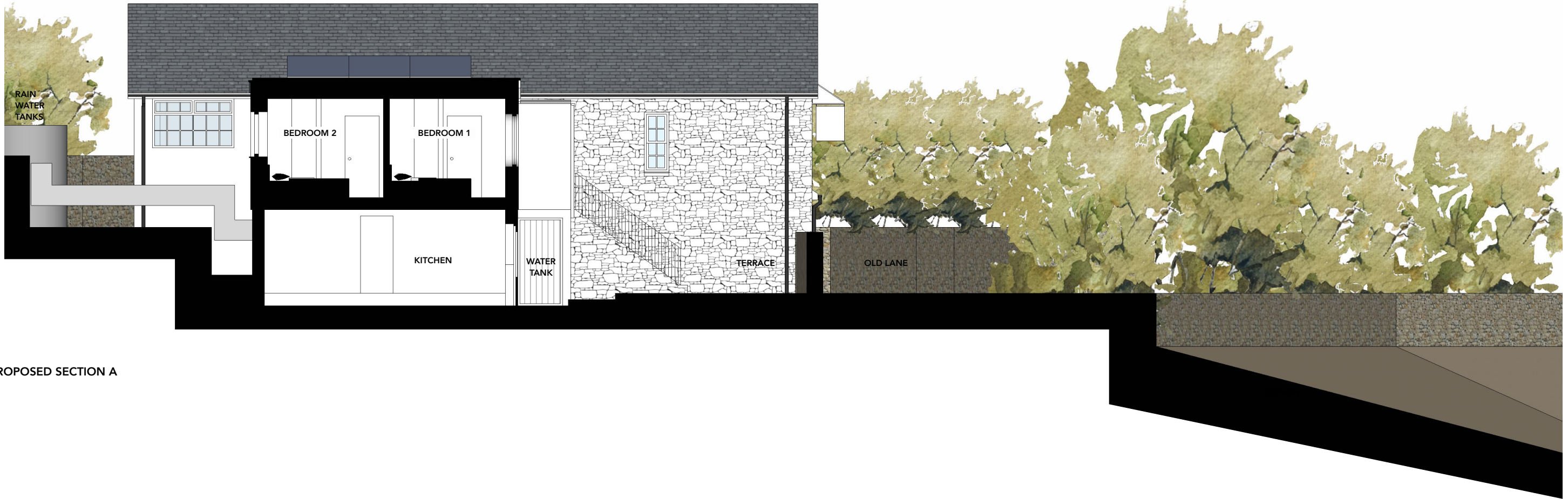
PROPOSED SECTION A