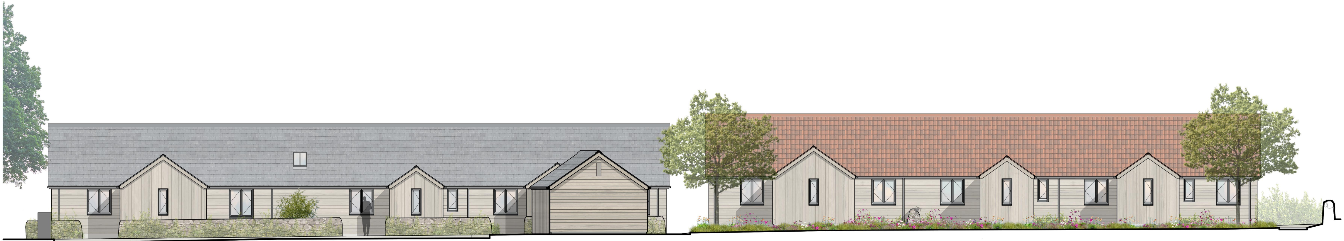
SITE SECTION B NORTH ELEVATION