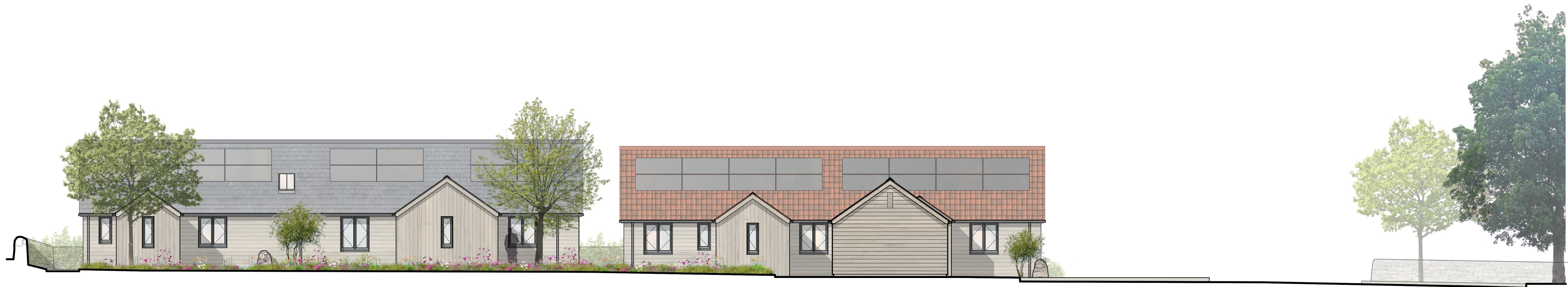
SITE SECTION A SOUTH ELEVATION