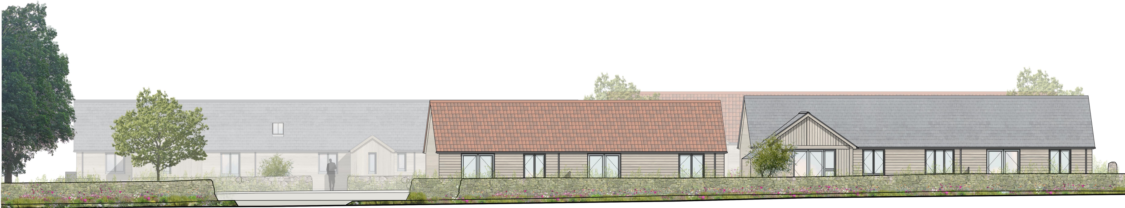
SITE SECTION C STREET ELEVATION