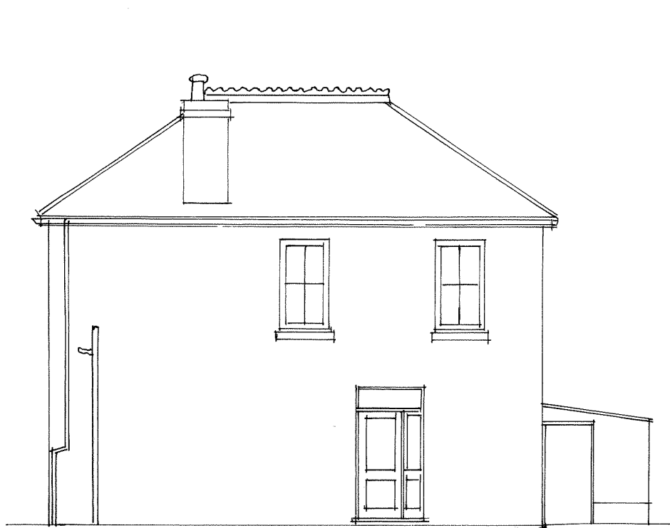
EAST ELEVATION 1:100 @ A3

By Liv Rickman at 12:25 pm, Aug 27, 2024