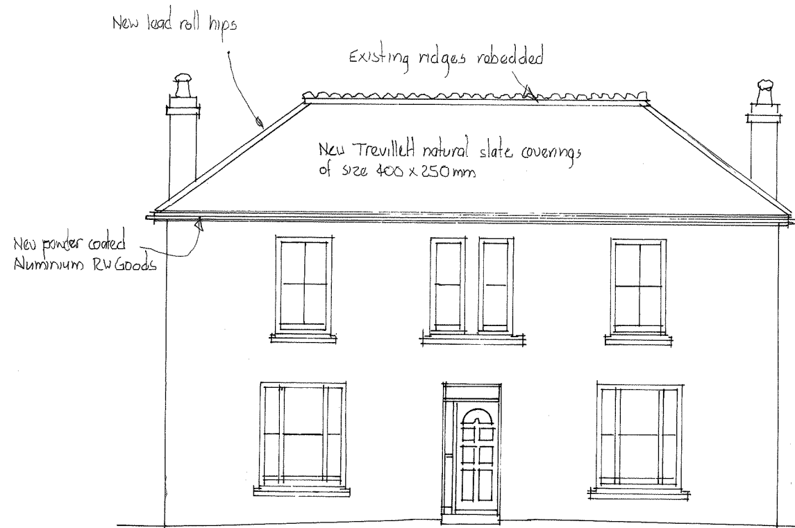
SOUTH ELEVATION 1:100 @ A3