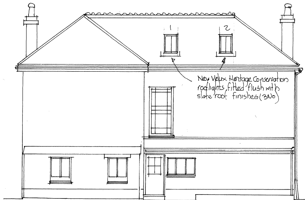
NORTH ELEVATION 1:100 @ A3