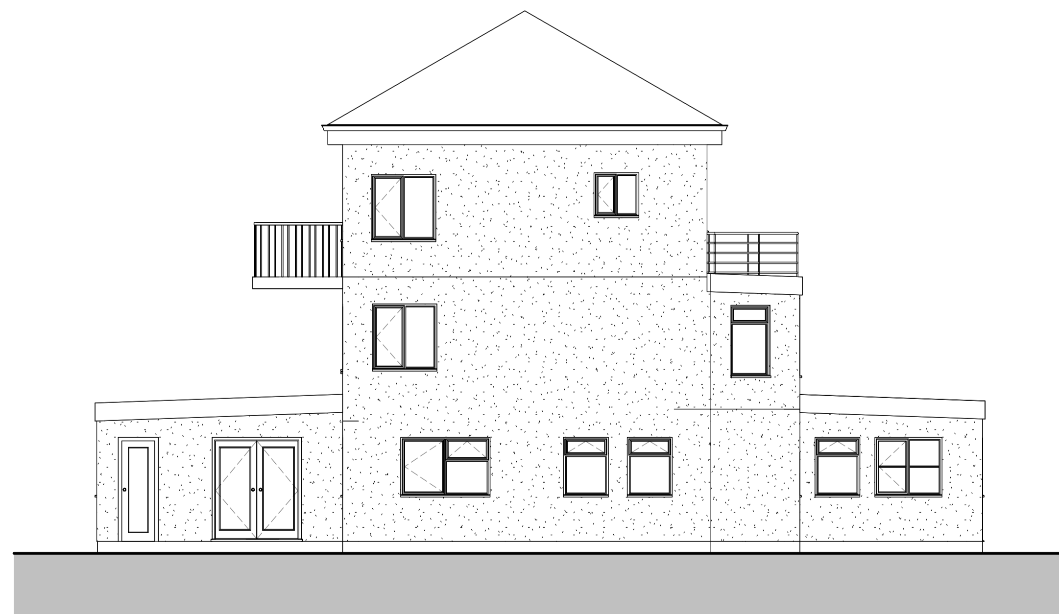
4 Existing West Elevation 1:75