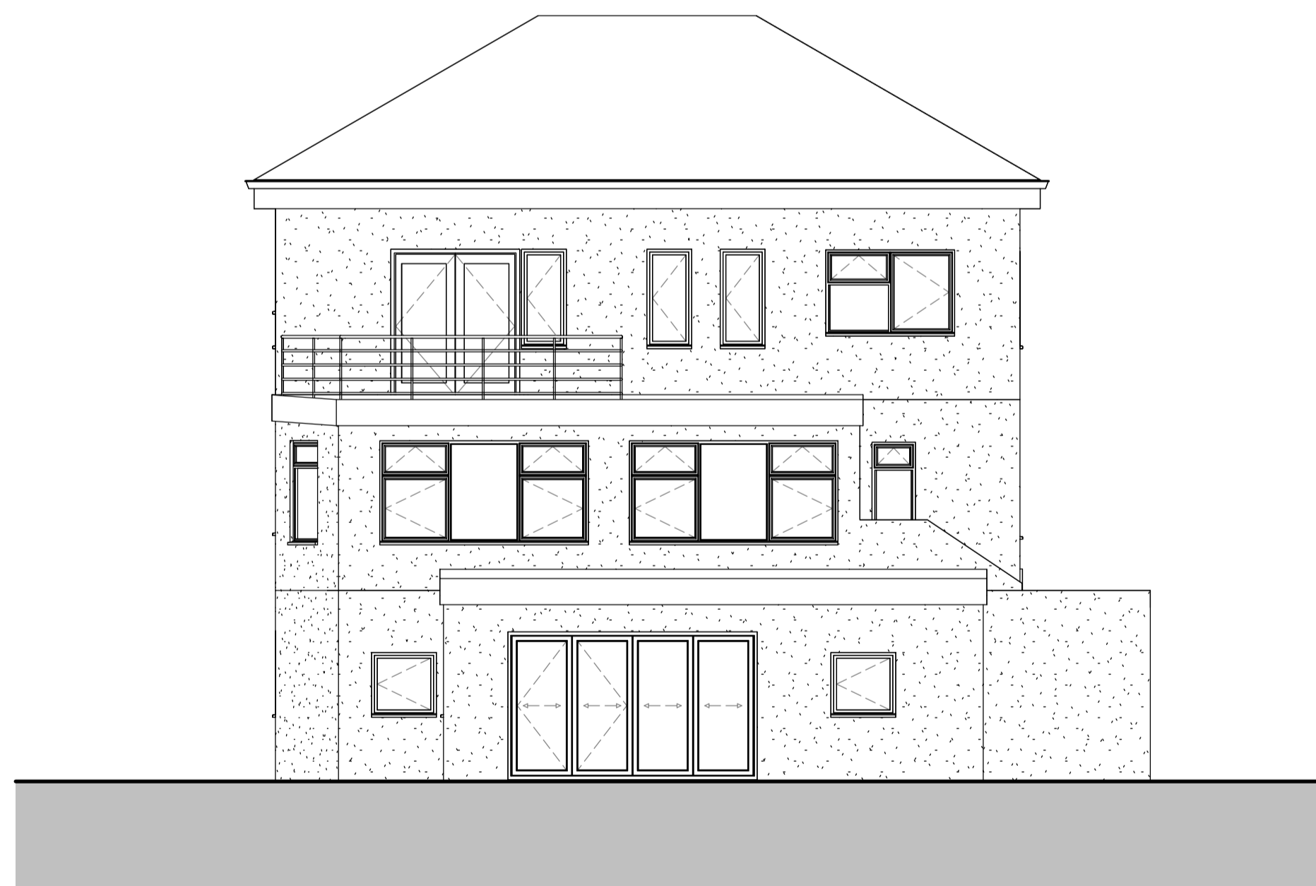
3 Existing South Elevation 1:75