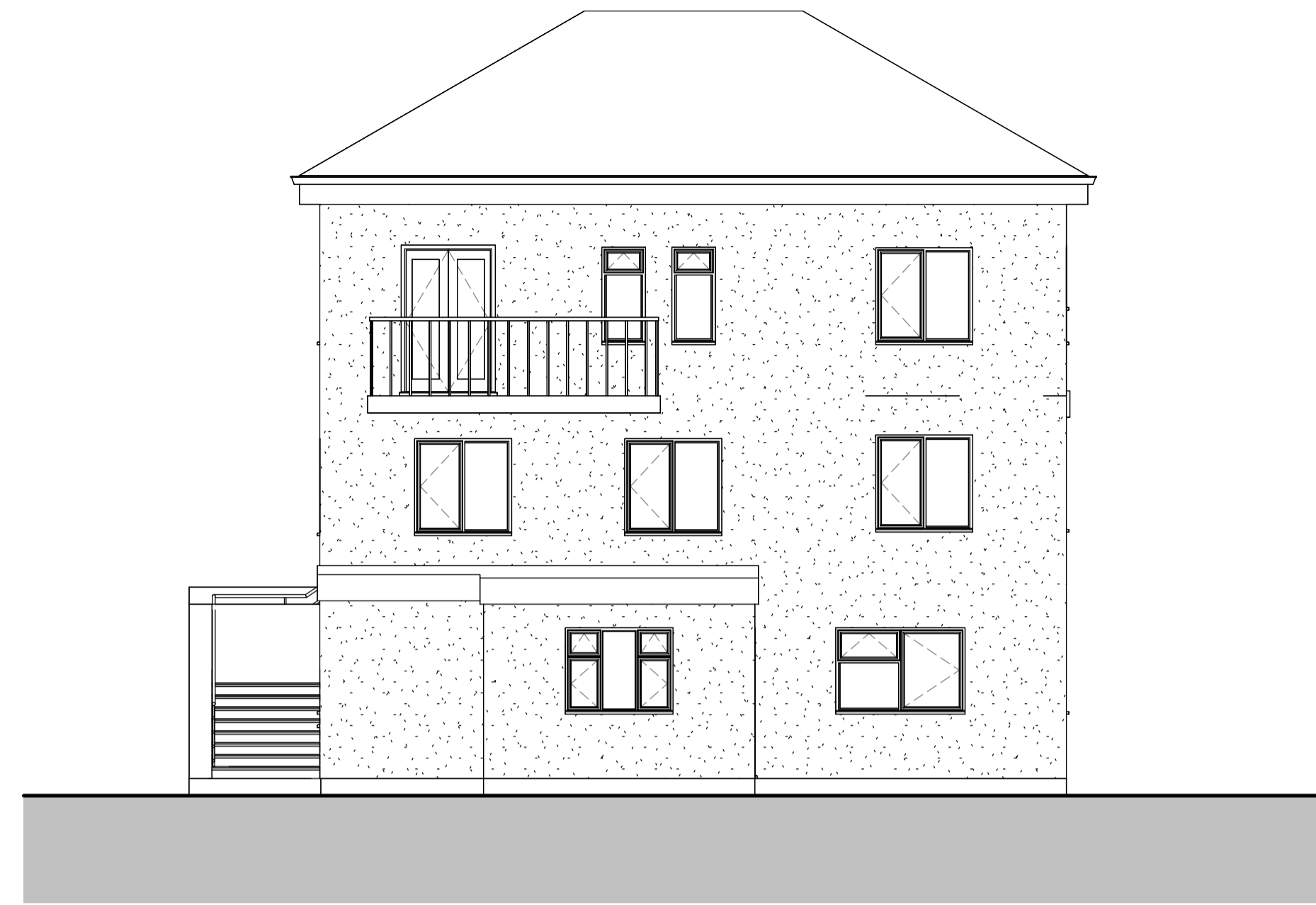
2 Existing North Elevation 1:75