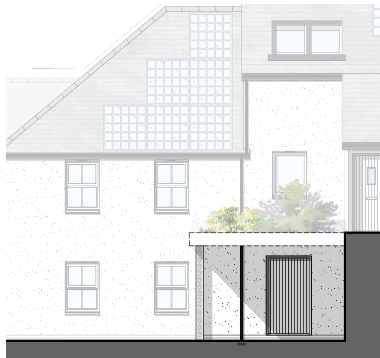
Rear Elevation (Cutting through structure) AS