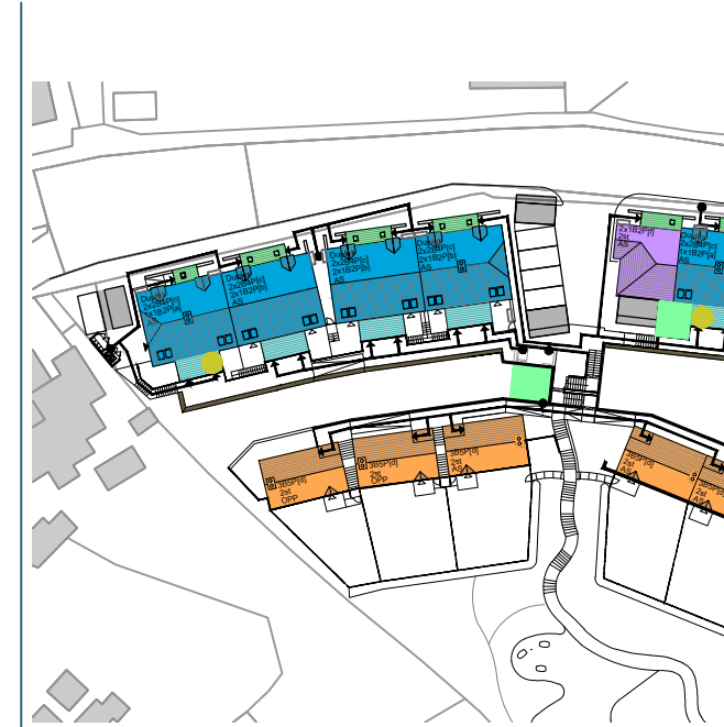
● - Communal clothes drying areas