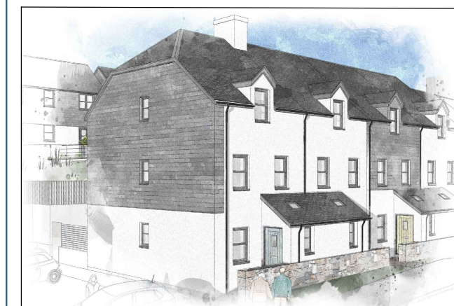
Perspective Indicative only, elevations take precedence

RECEIVED By Liv Rickman at 4:58 pm, May 03, 2024