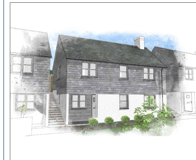
Perspective Indicative only, elevations take precedence

Gross Internal Floor Area 93.2sq.m. - 1003sq.ft.