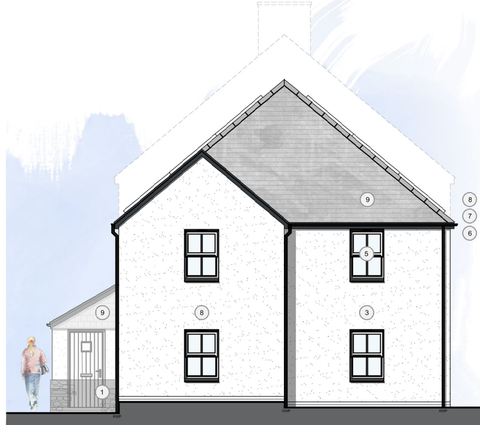
Front/side Elevation (Parking lot)