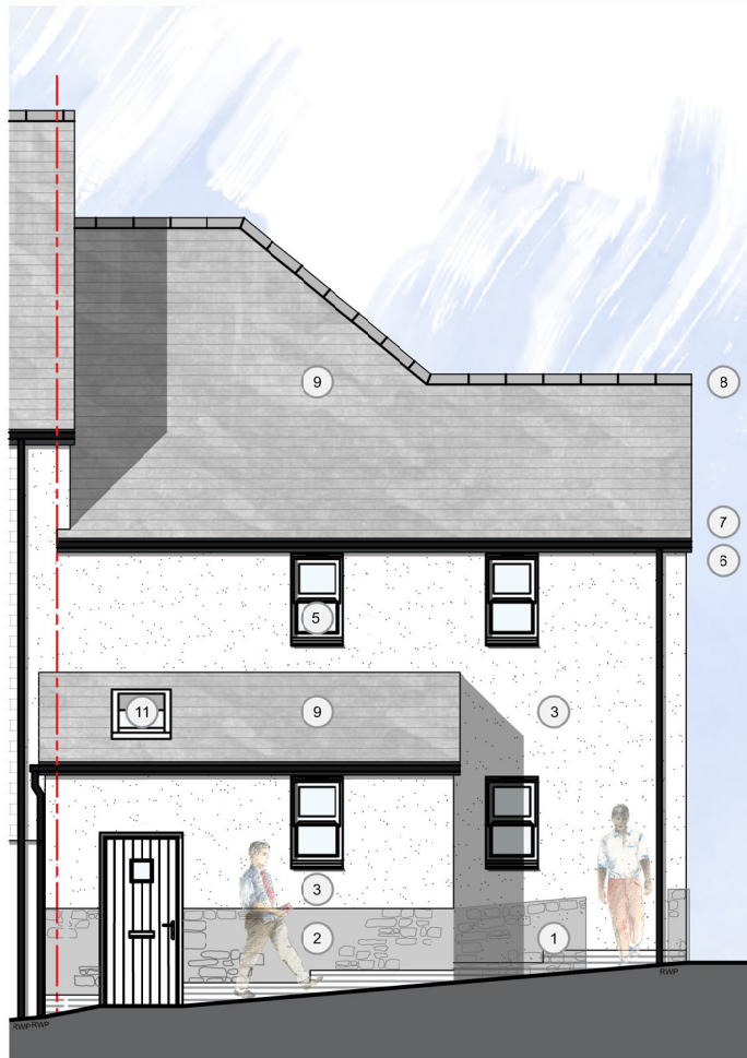
Front Elevation (Telegraph Road)