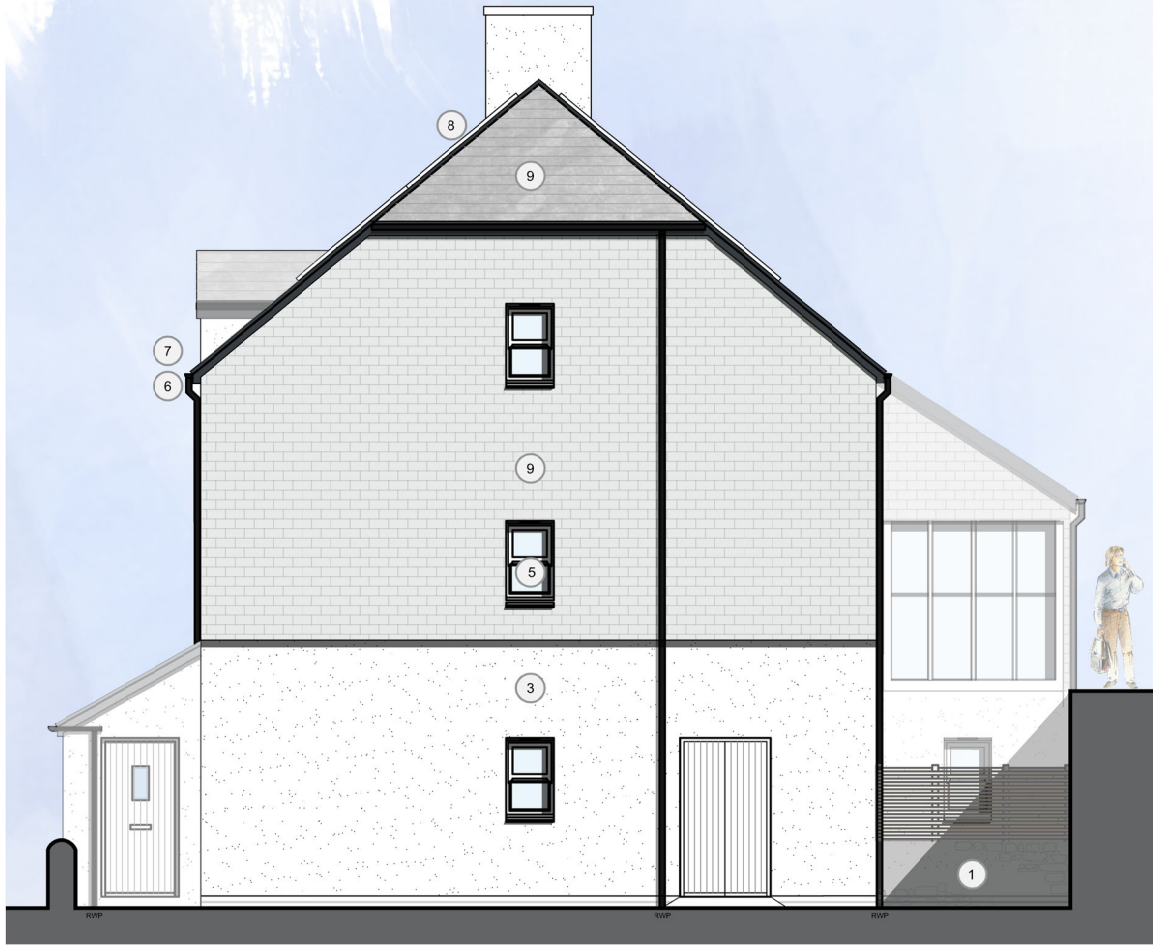
Parking Lot (East) Elevation AS