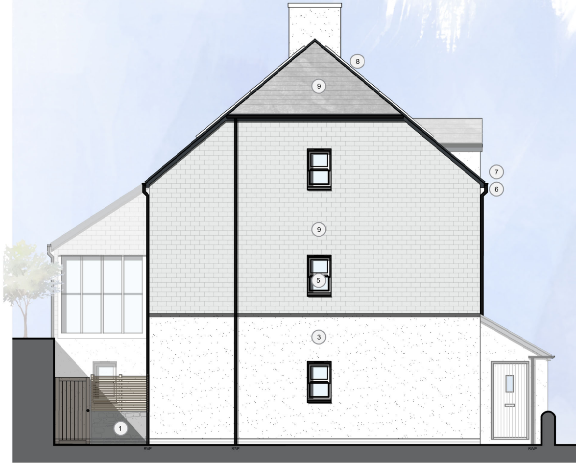
Parking Lot (West) Elevation OPP