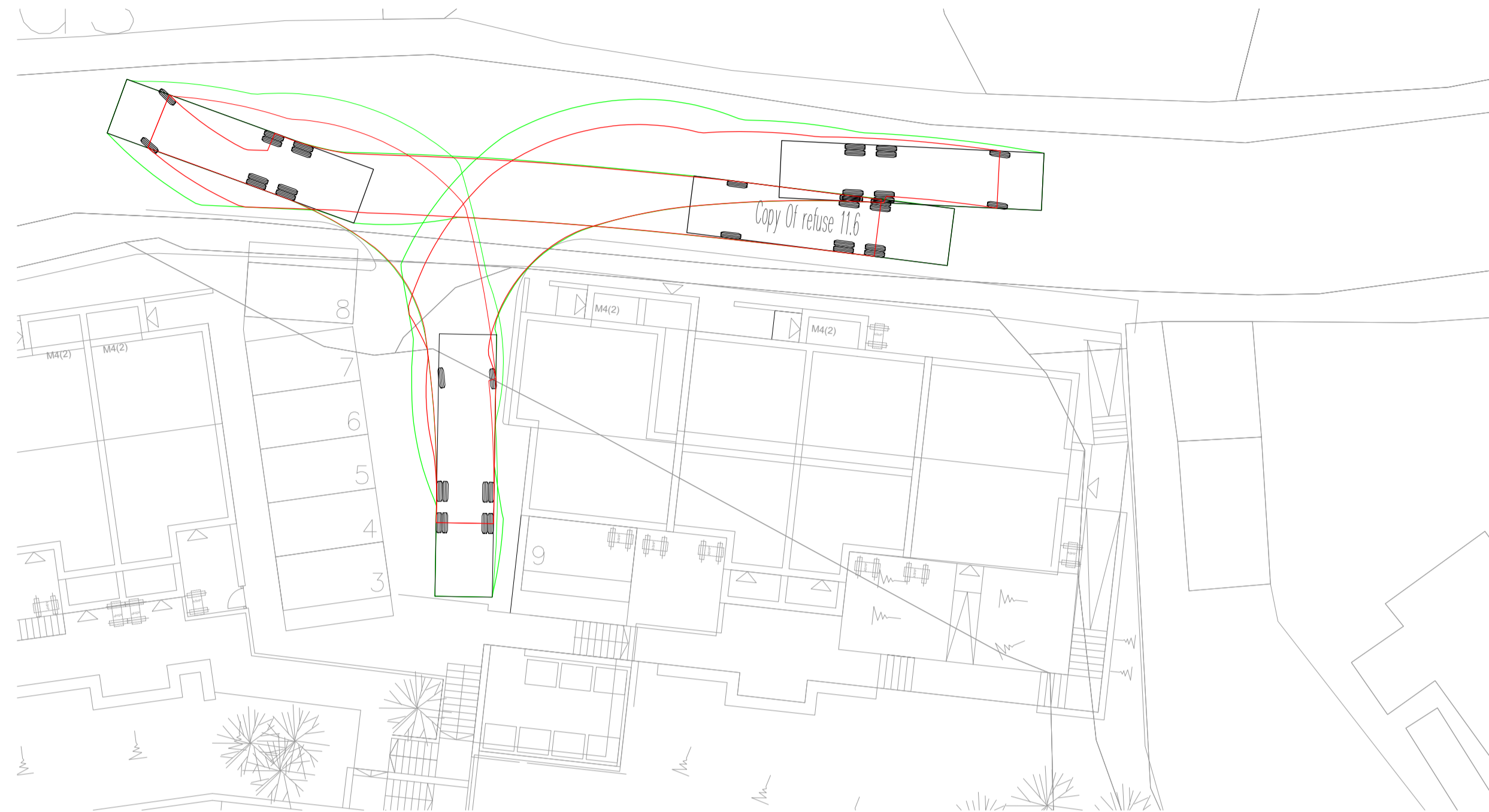
SWEPT PATH ANALYSIS - REFUSE TRUCK SCALE 1:200