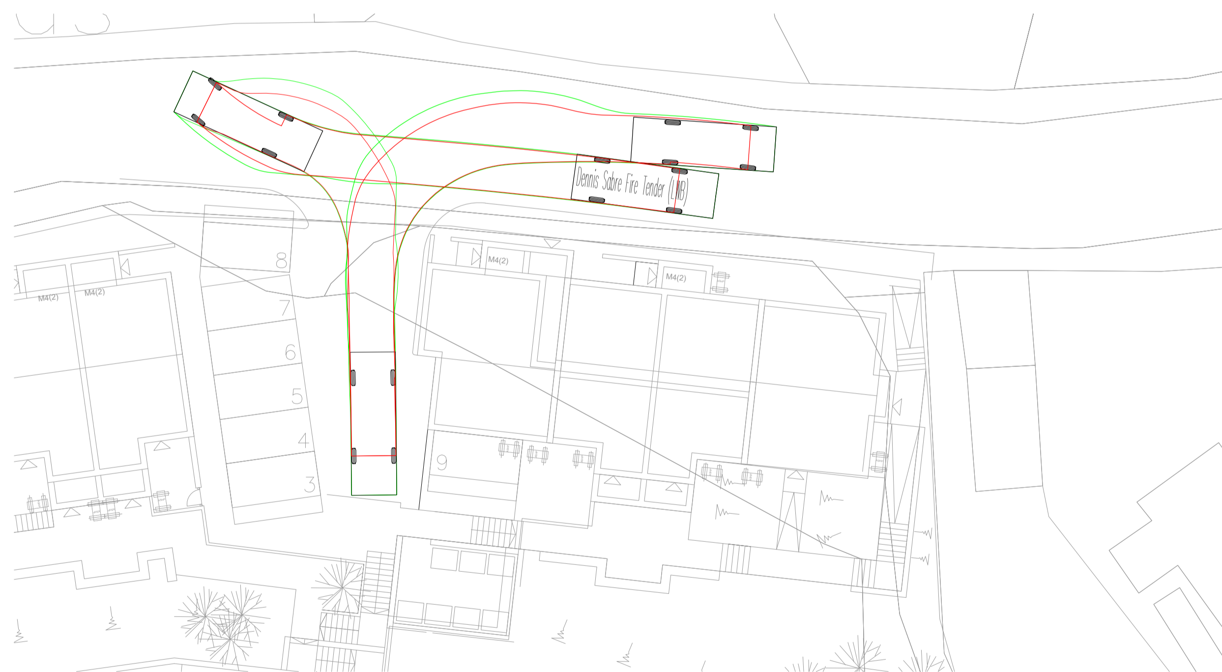
SWEPT PATH ANALYSIS - FIRE TENDER SCALE 1:200