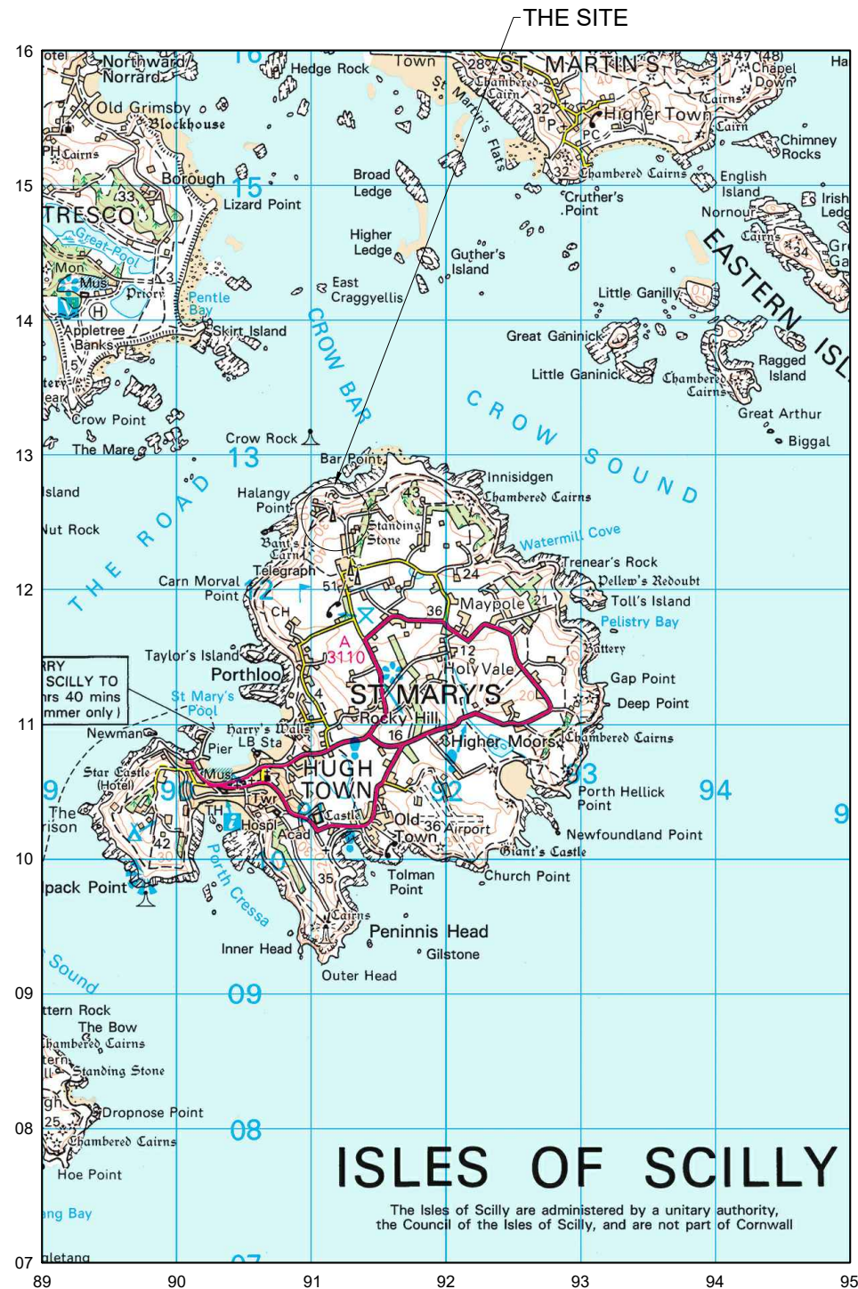
LOCATION PLAN SCALE 1:50,000