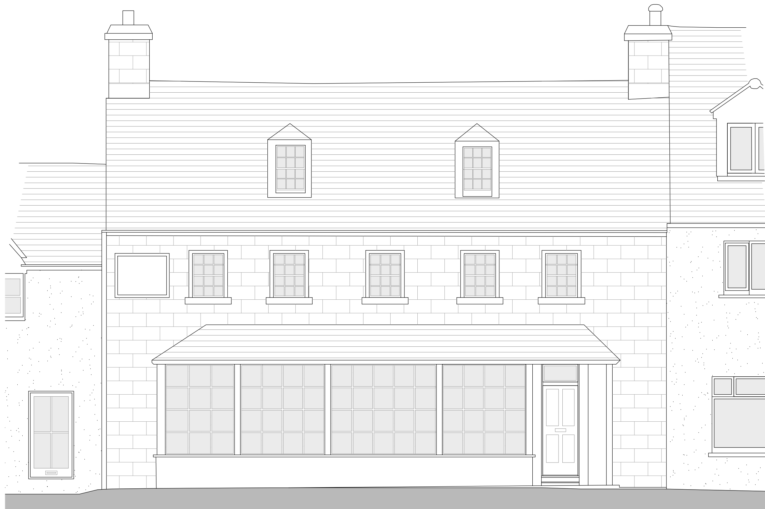
01 EXISTING NORTH ELEVATION