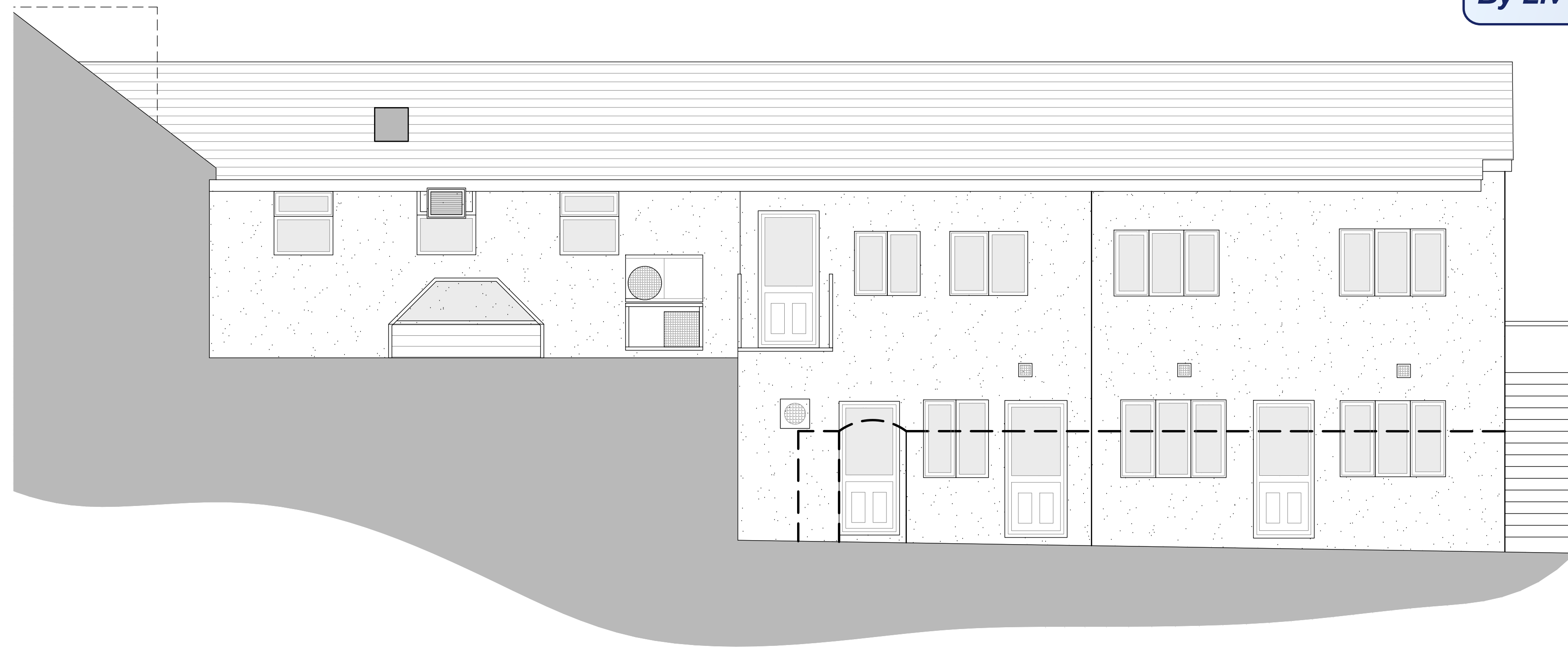
04 EXISTING WEST ELEVATION