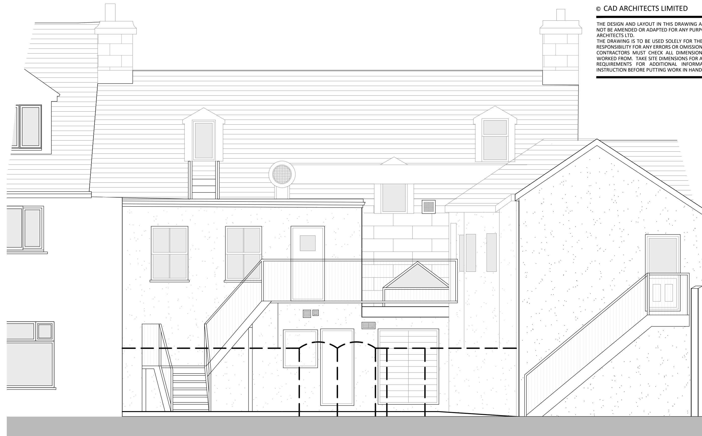
02 EXISTING SOUTH ELEVATION