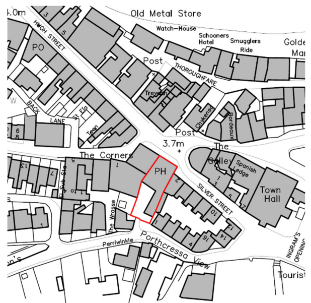
Figure 2: Location Plan- Bishop & Wolf in red

Escape, in the event of a flood, would can be coordinated in either direction (north and south) via access through the ground floor pub. No known flood proofing measures are installed on the building.