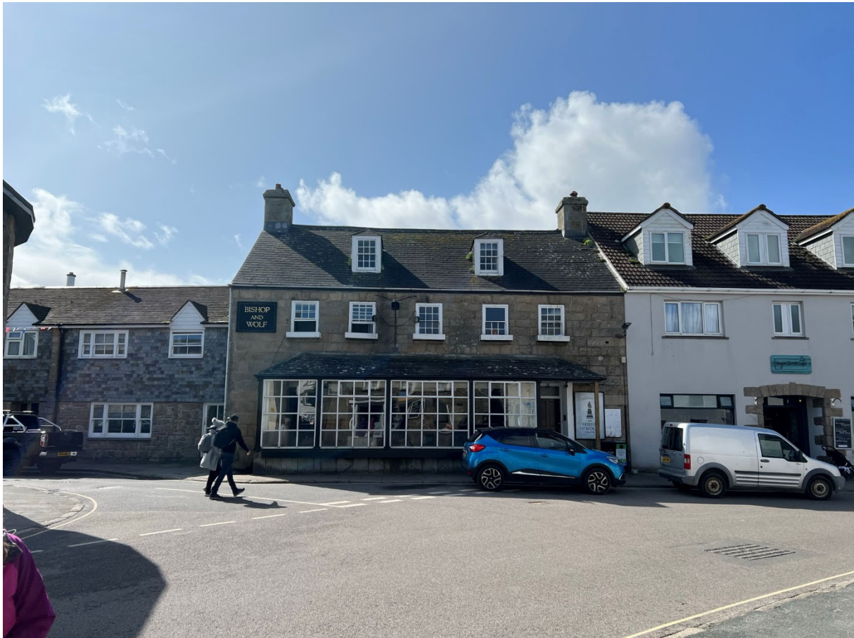
Figure 1: The Bishop & Wolf