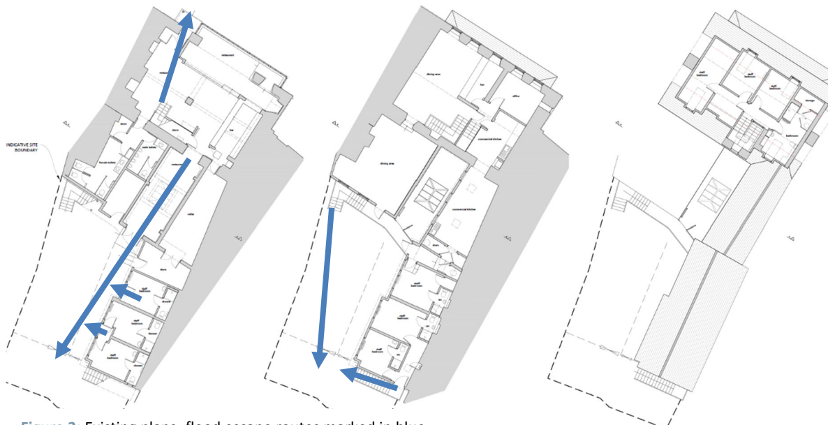
Figure 3: Existing plans- flood escape routes marked in blue