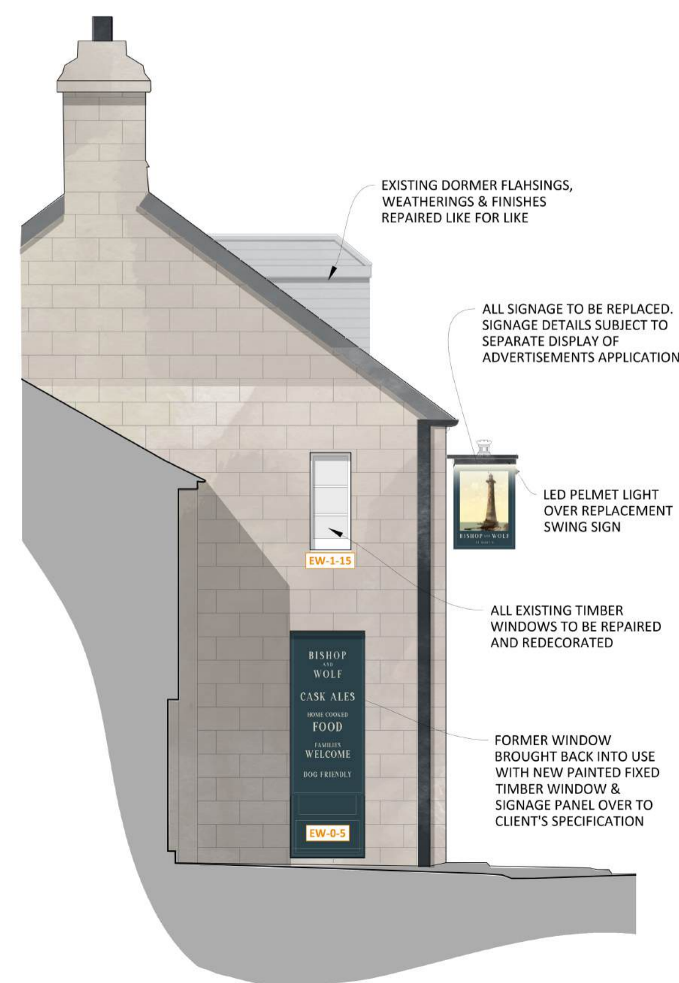
03 PROPOSED EAST ELEVATION