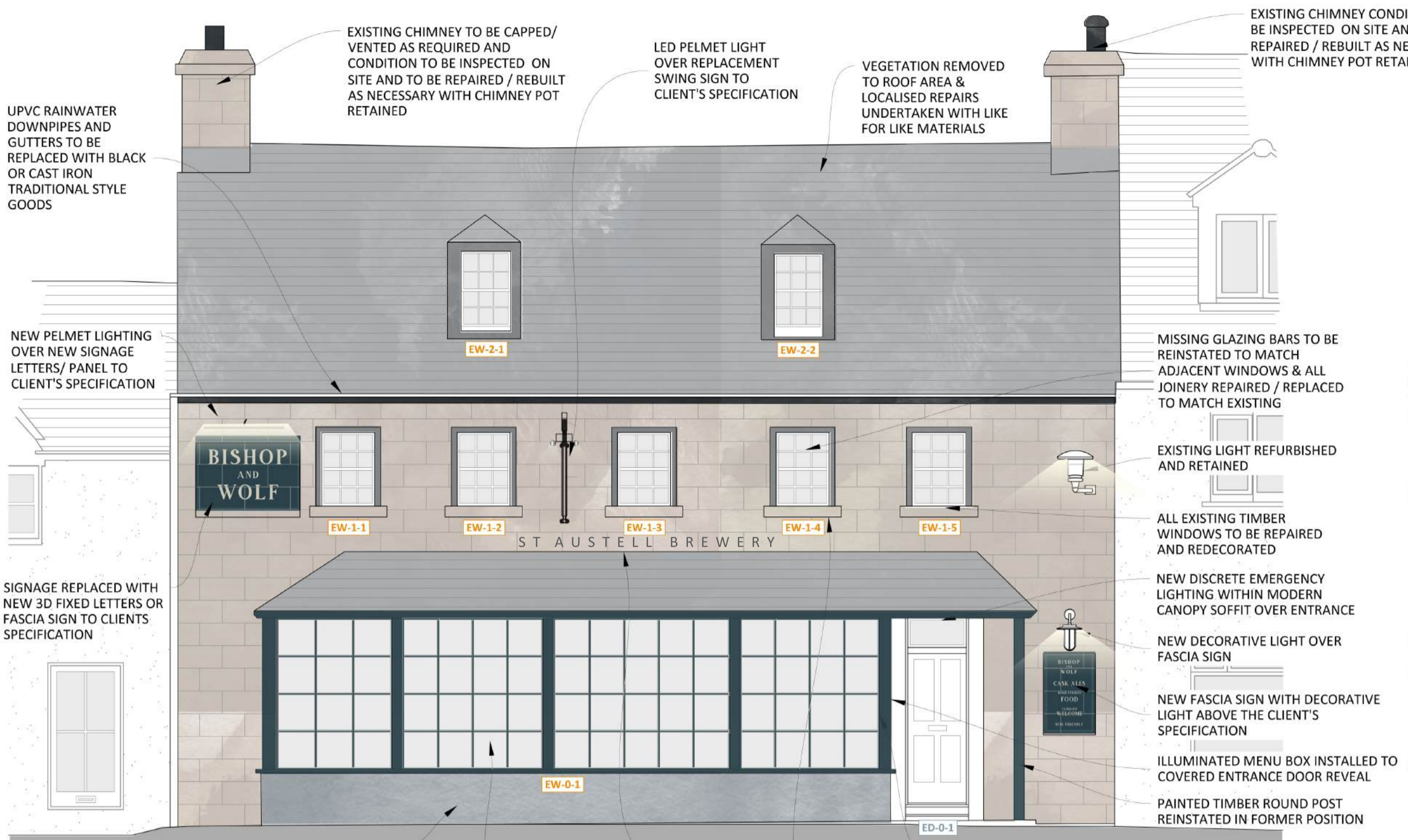
01 PROPOSED NORTH ELEVATION