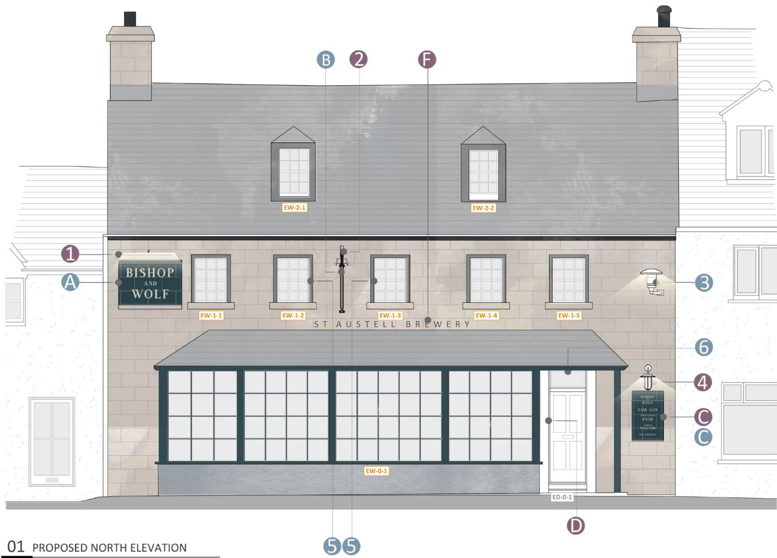
01 PROPOSED NORTH ELEVATION