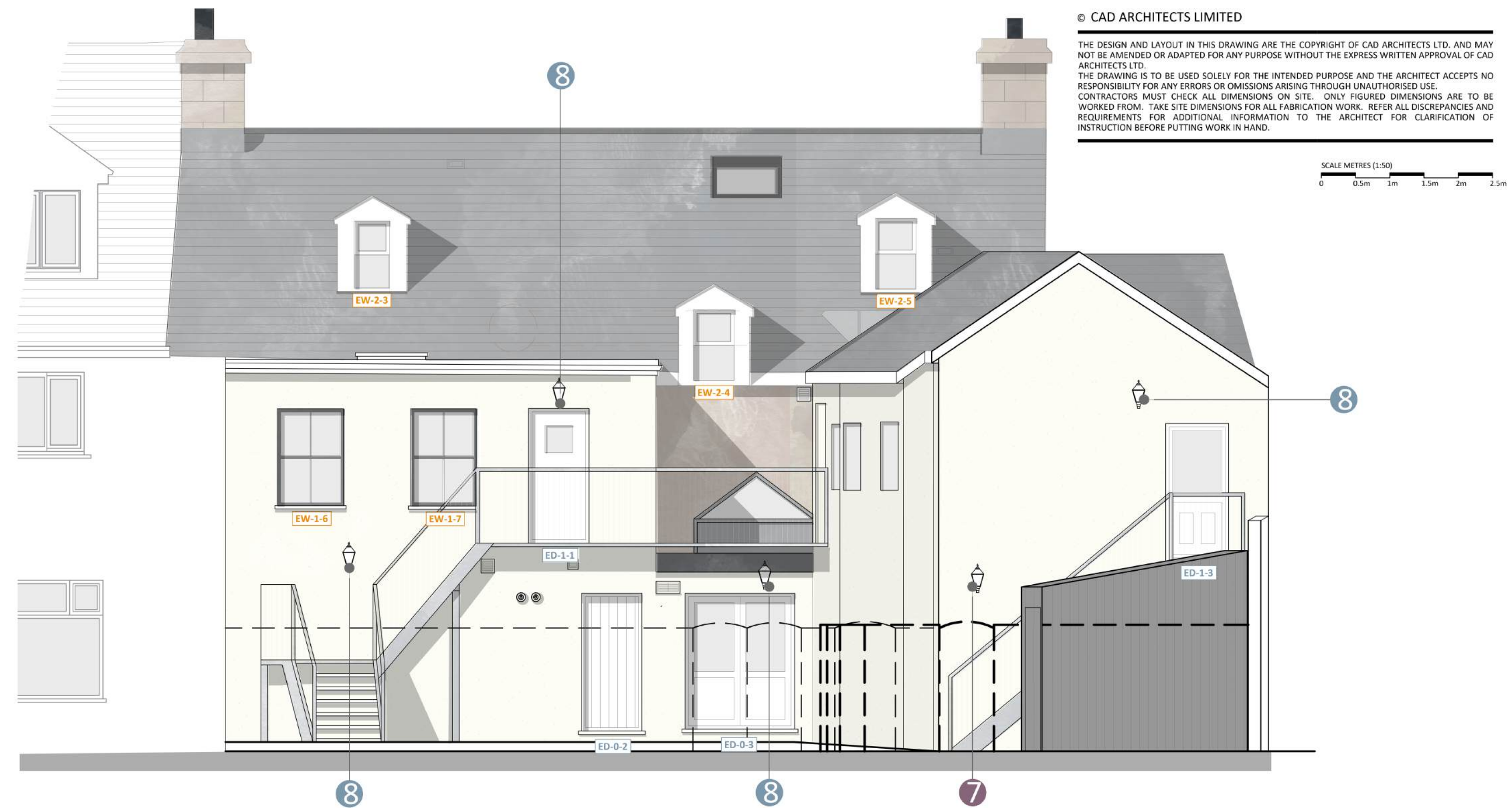
02 PROPOSED SOUTH ELEVATION