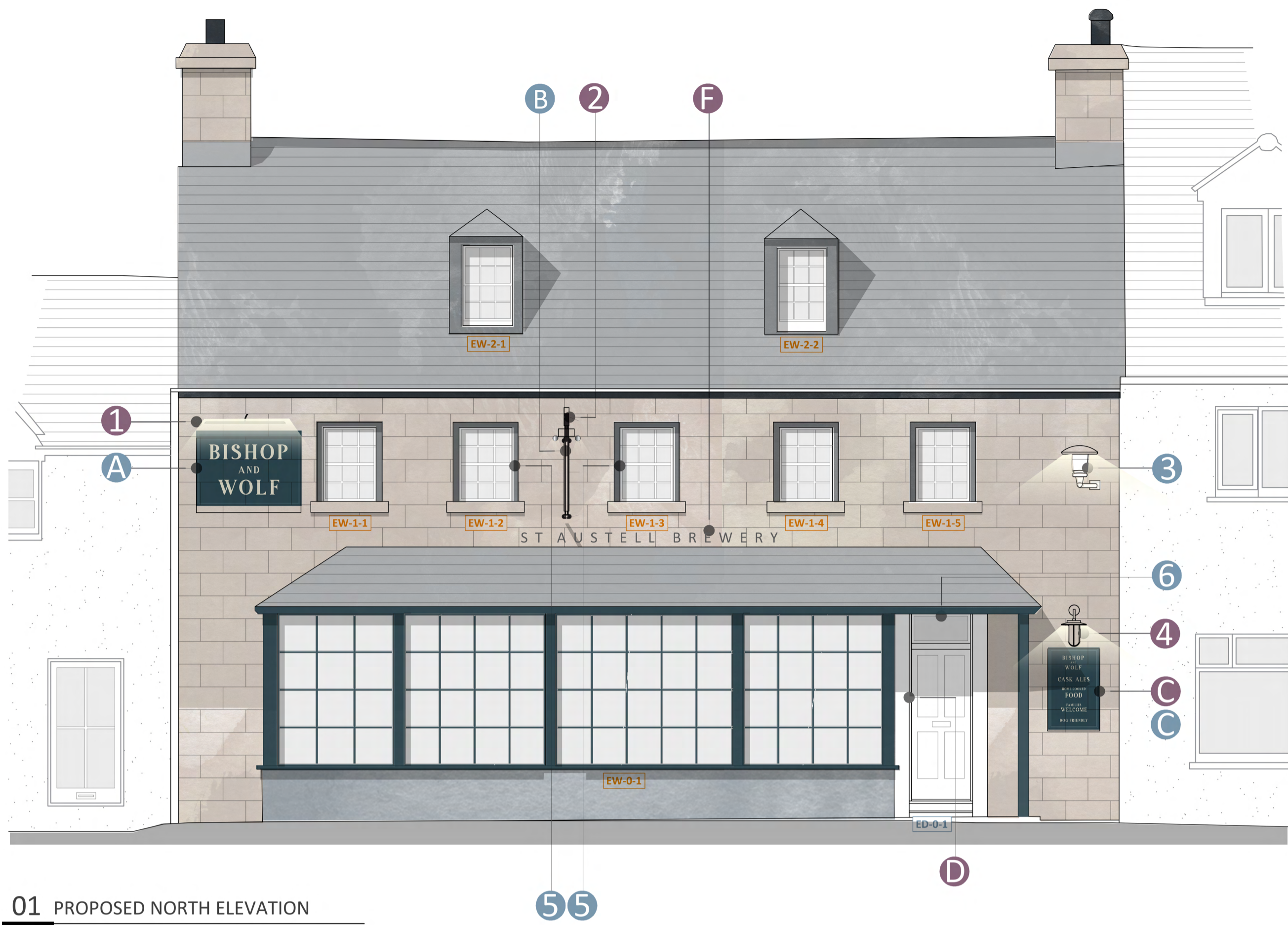
01 PROPOSED NORTH ELEVATION