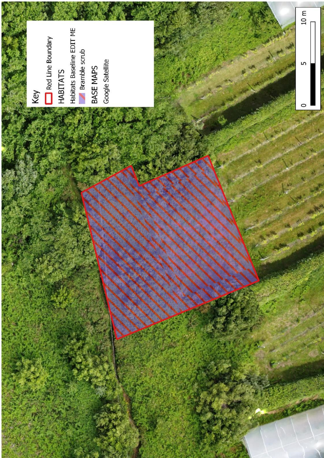
Figure 01 – Existing Habitats