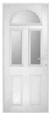
Existing door style Proposed door style