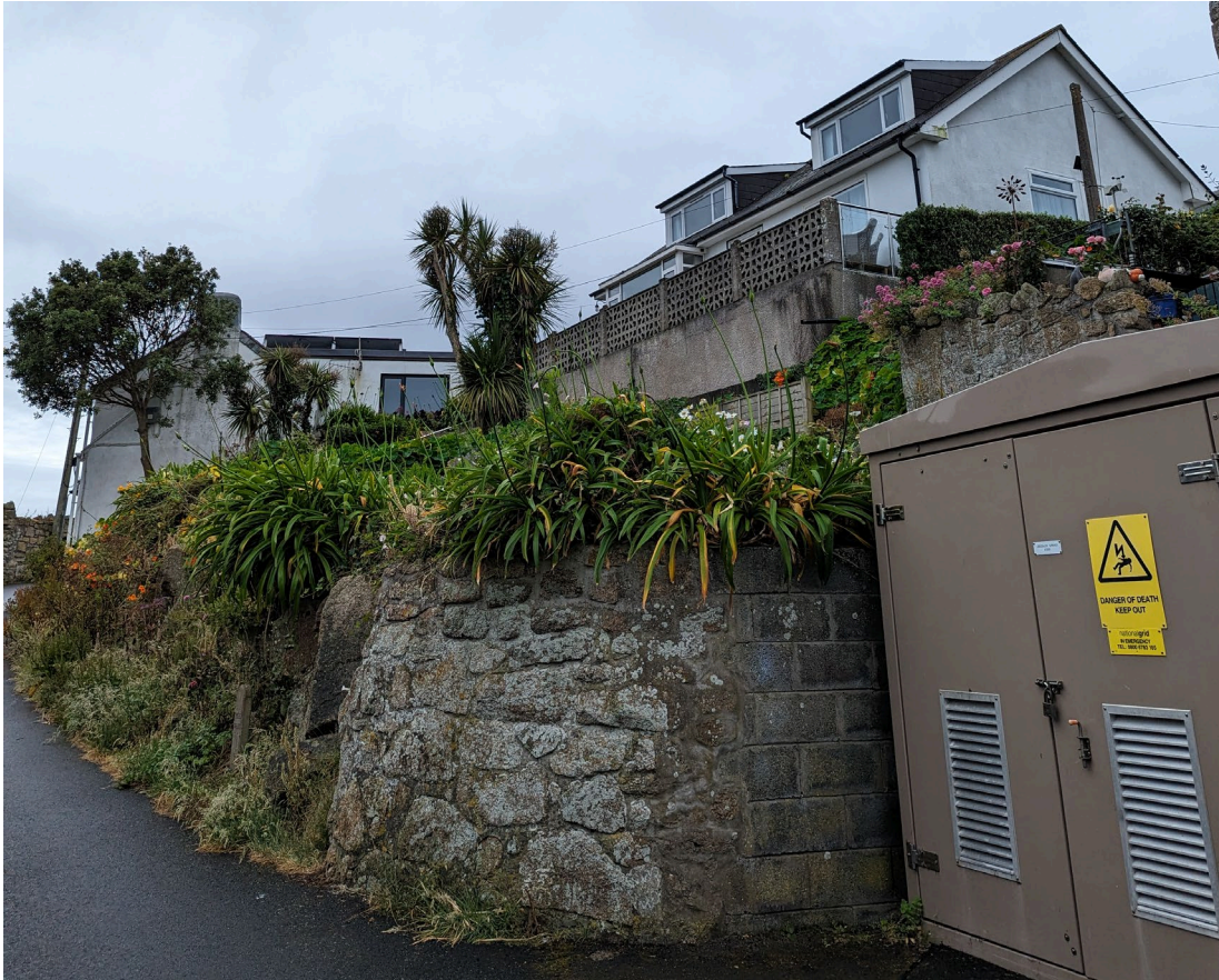
Figure 4 View from the road approaching from the north showing 'High Steps'