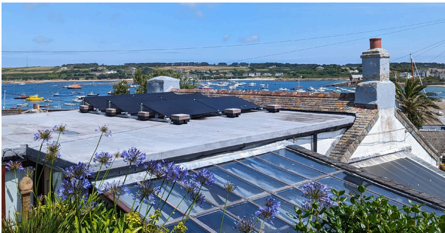
Figure 1 View from south side of garden adjacent to gable wall of neighbouring property 'West Mount'

This retrospective proposal is for the installation of a 6-panel solar PV array on the flat roof of the property. The panels are mounted on rails in a 5m x 3.6m array raised at an angle of 10 degrees with a maximum height of 307mm orientated The array is positioned so the panels are to the north side of the flat roof set just behind the ridge of the main cottage of which the max height of the panels sits just below.