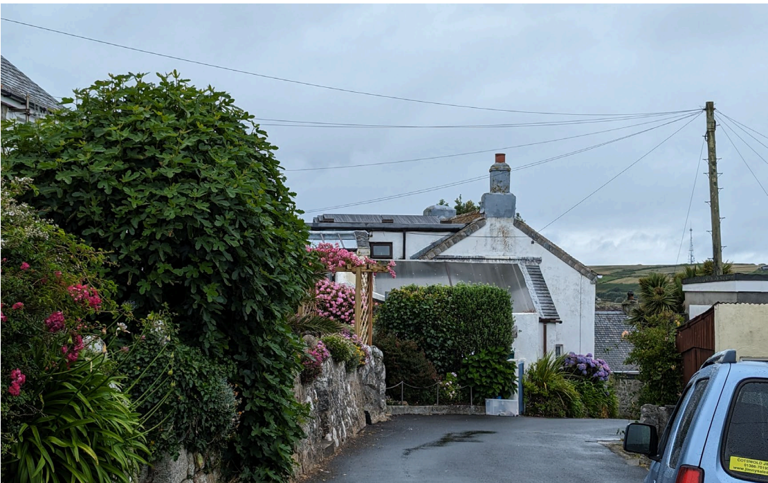
Figure 3 View from the road approaching from the south