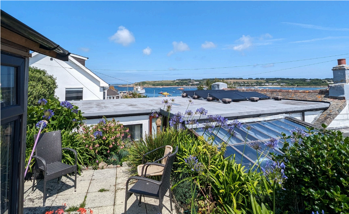
Figure 2 View from same location with the property 'High Steps' shown on the north side and set back