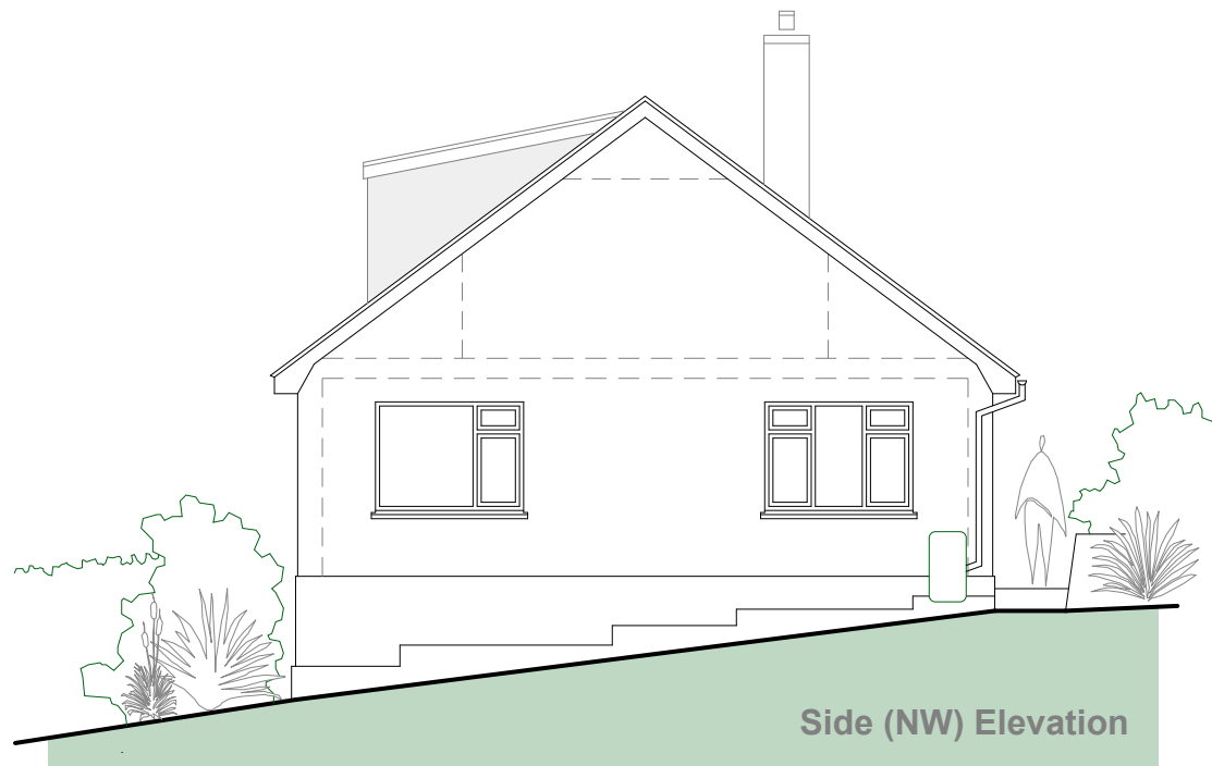
Side (NW) Elevation