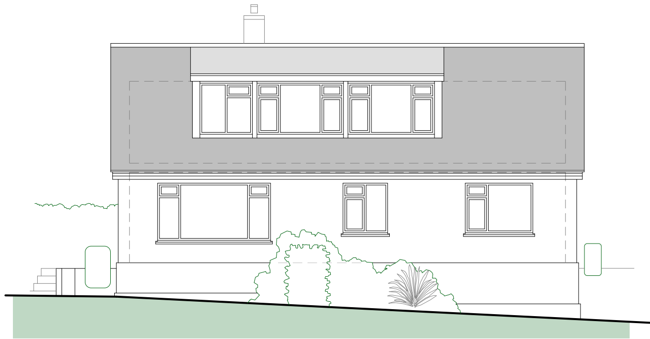
Rear (NE) Elevation