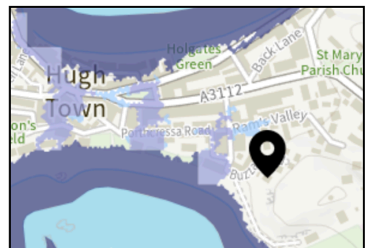
Flood Map Extract