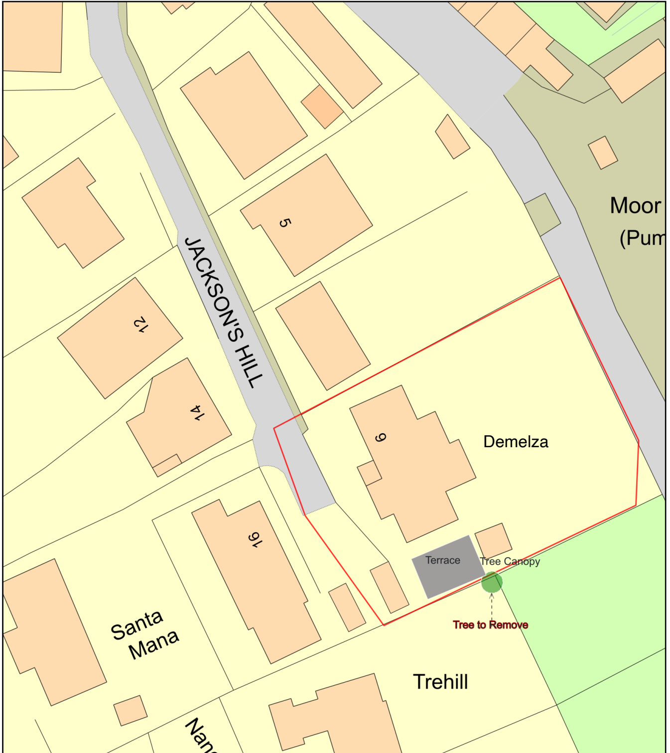
Demelza – Figure 1.