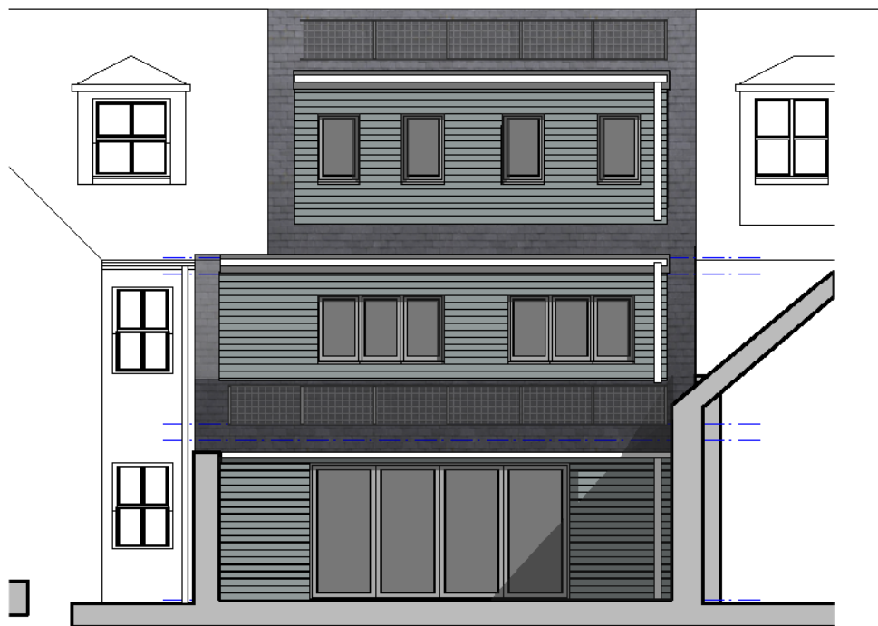
12 Prelim Rear Elevation Scale: 1:100

RECEIVED By Liv Rickman at 6:10 pm, Feb 12, 2025