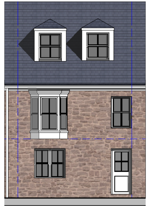
11 Prelim Front Elevation Scale: 1:100