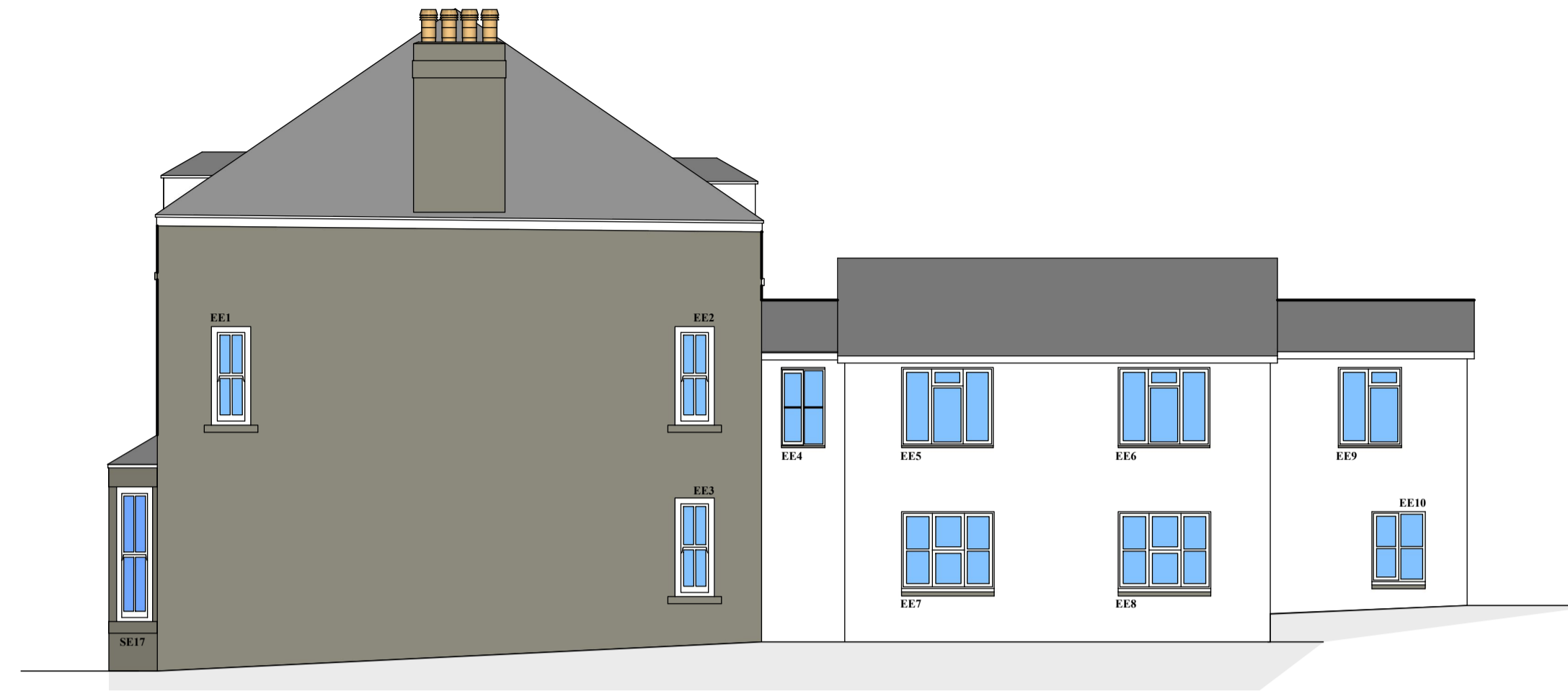
East Elevation 1:100