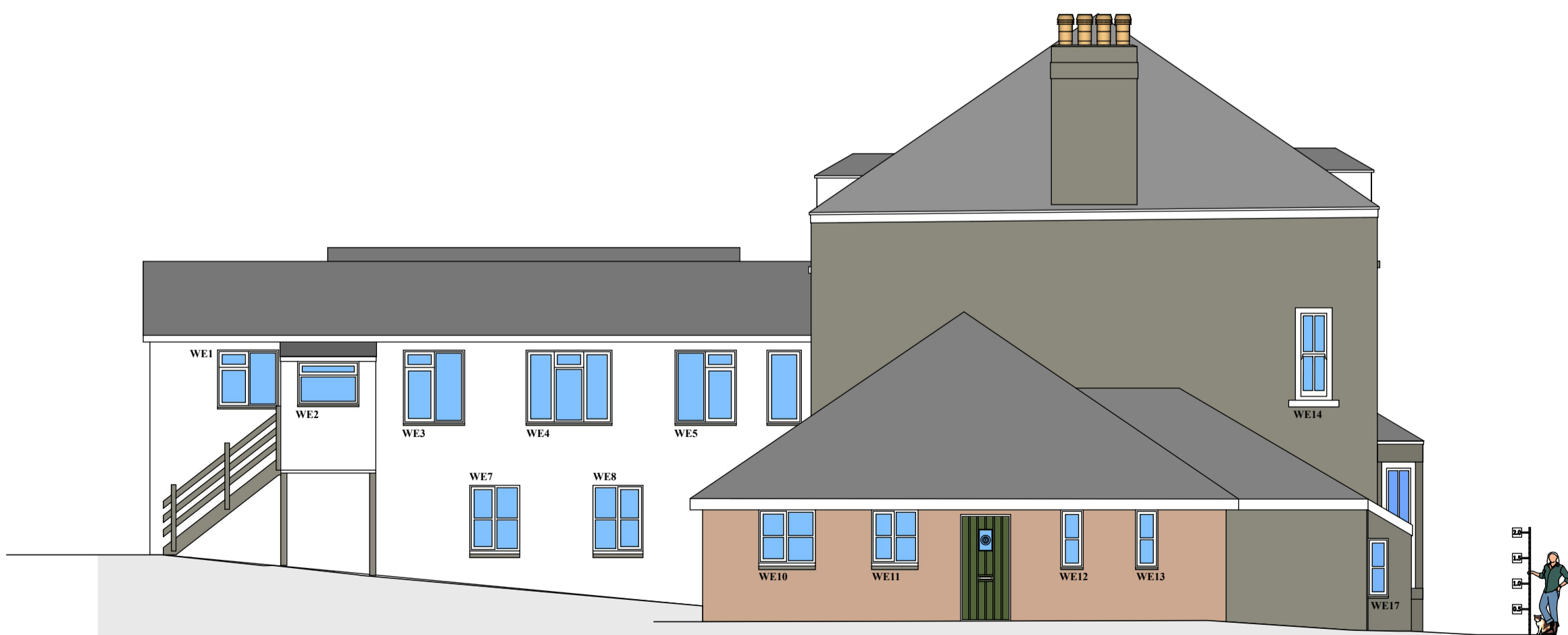
West Elevation 1:100