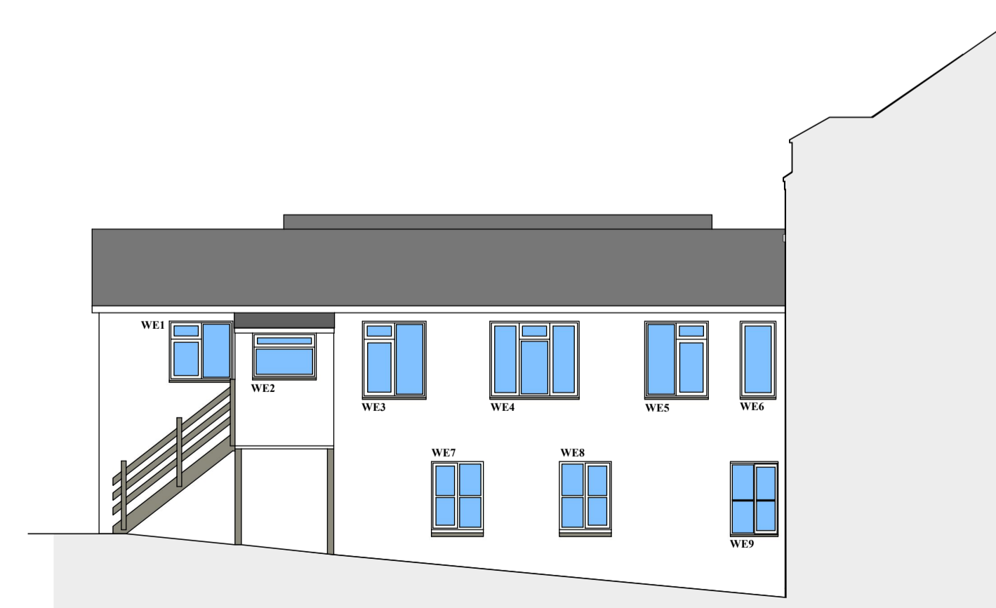
CC West Elevation 1:100