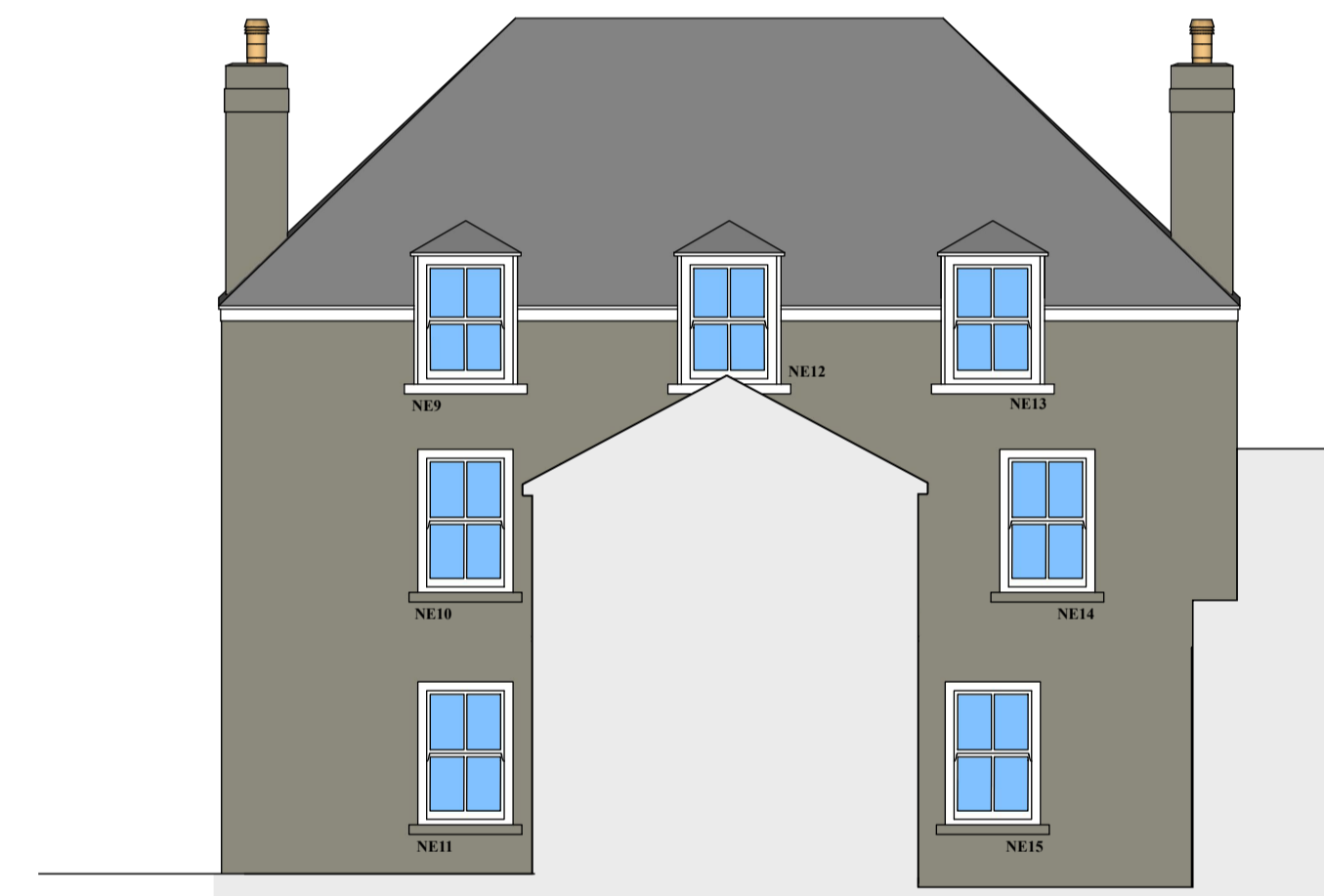
BB North Elevation 1:100