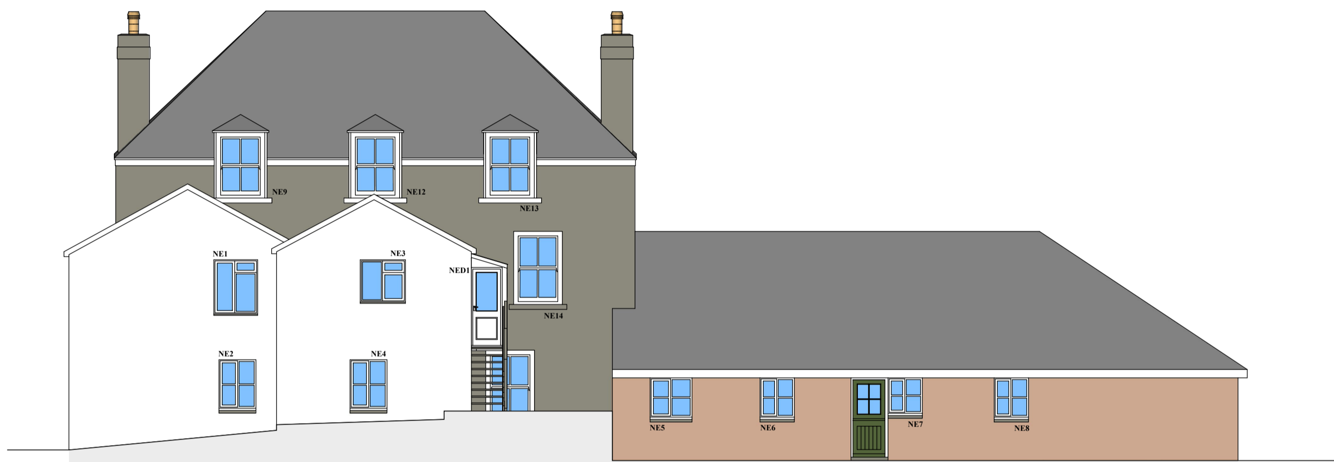
Existing North Elevation 1:100