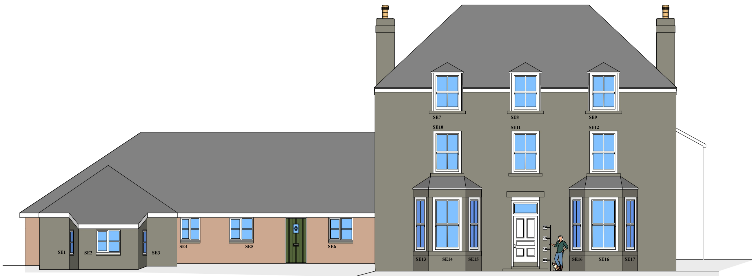
South Elevation 1:100