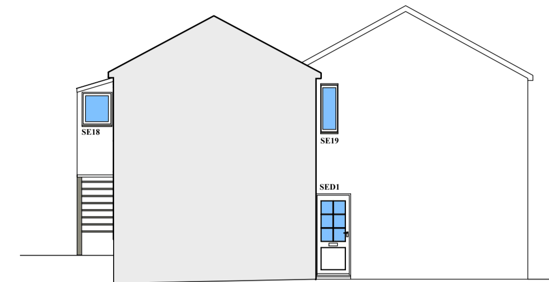
AA Existing South Elevation 1:100