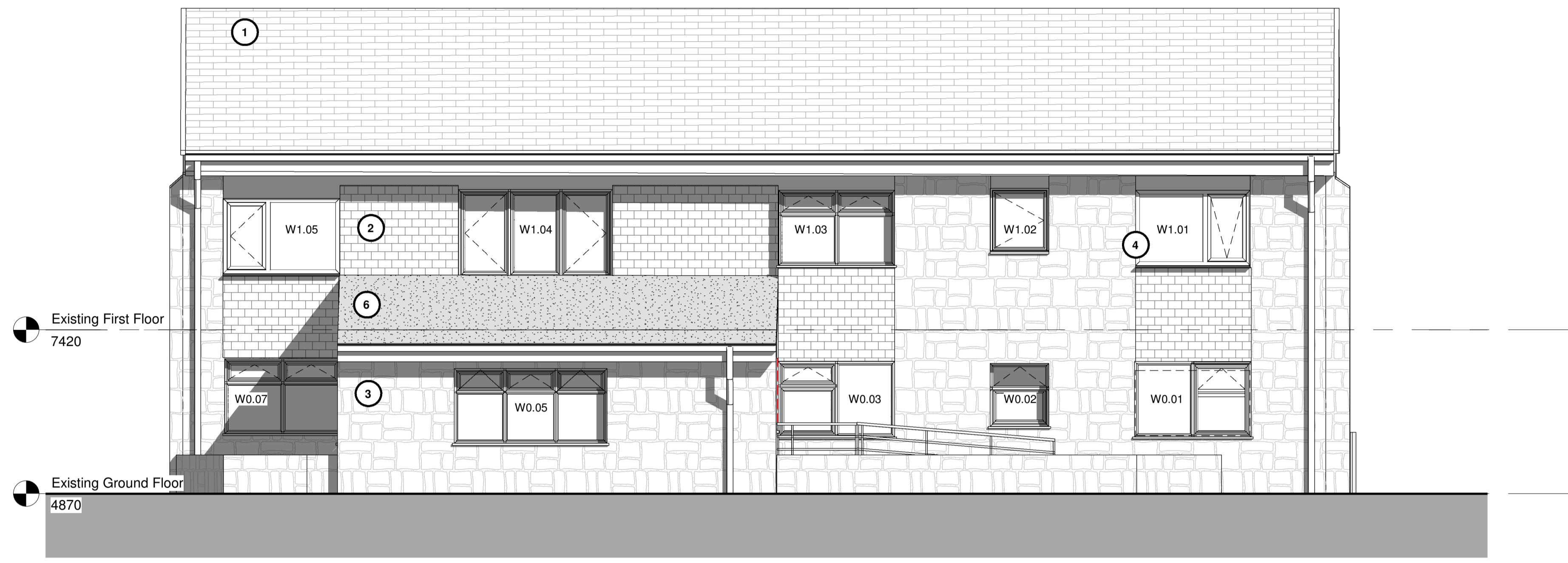
North Elevation - No