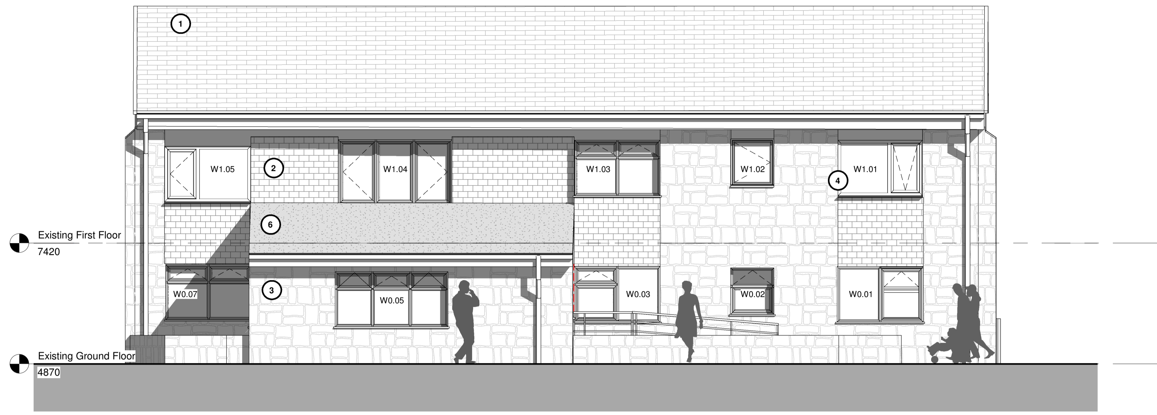
North Elevation - No Changes