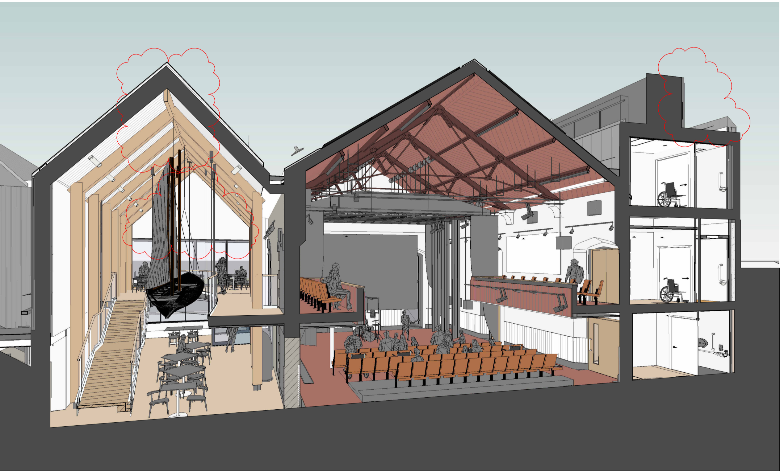
4 Scheme Cutaway

Notes: Drawings are based on survey data and may not accurately represent what is physically present. Do not scale from this drawing. All dimensions are to be verified on site before proceeding with the work. All dimensions are in millimeters unless noted otherwise. Purcell shall be notified in writing of any discrepancies.