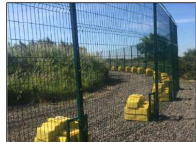
Defender V Mesh Temporary Fencing with BraceBlok - 2.4m