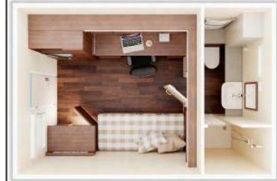
Bespoke Sleeper Unit