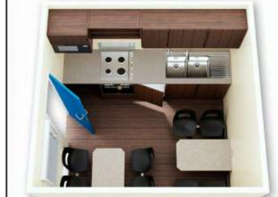
Bespoke Junior Diner