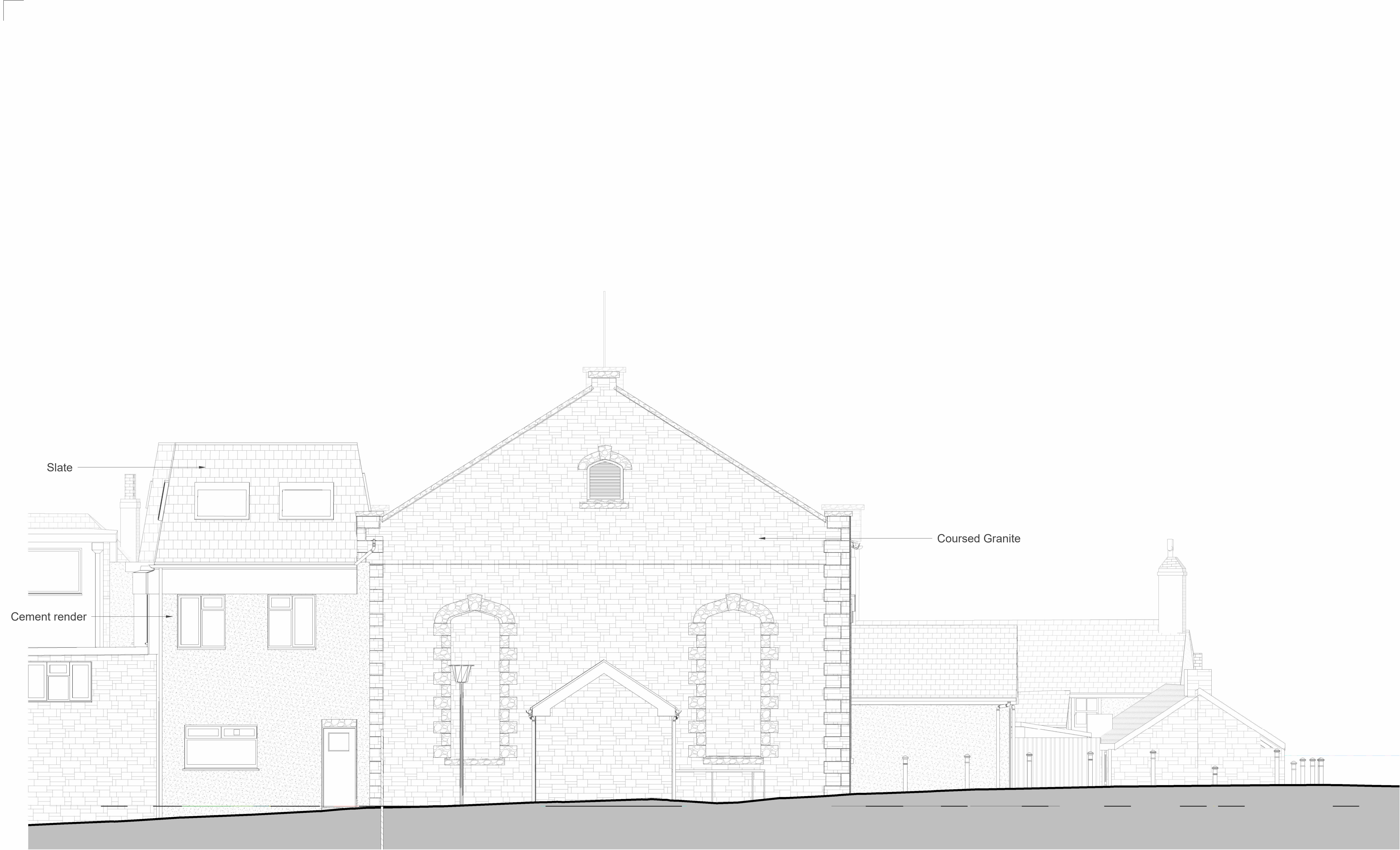
1 Planning South West Elevation - Existing 1 : 50

Notes: Drawings are based on survey data and may not accurately represent what is physically present. Do not scale from this drawing. All dimensions are to be verified on site before proceeding with the work. All dimensions are in millimeters unless noted otherwise. Purcell shall be notified in writing of any discrepancies.