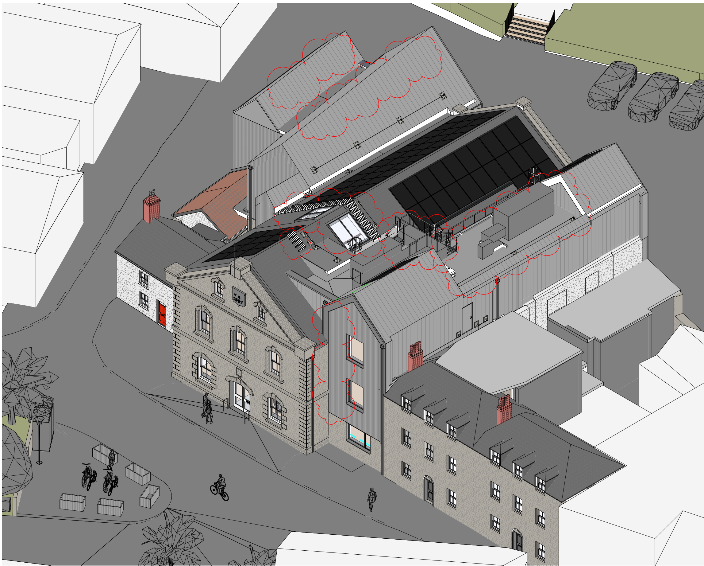
4 North West Axonometric

Notes: Drawings are based on survey data and may not accurately represent what is physically present. Do not scale from this drawing. All dimensions are to be verified on site before proceeding with the work. All dimensions are in millimeters unless noted otherwise. Purcell shall be notified in writing of any discrepancies.