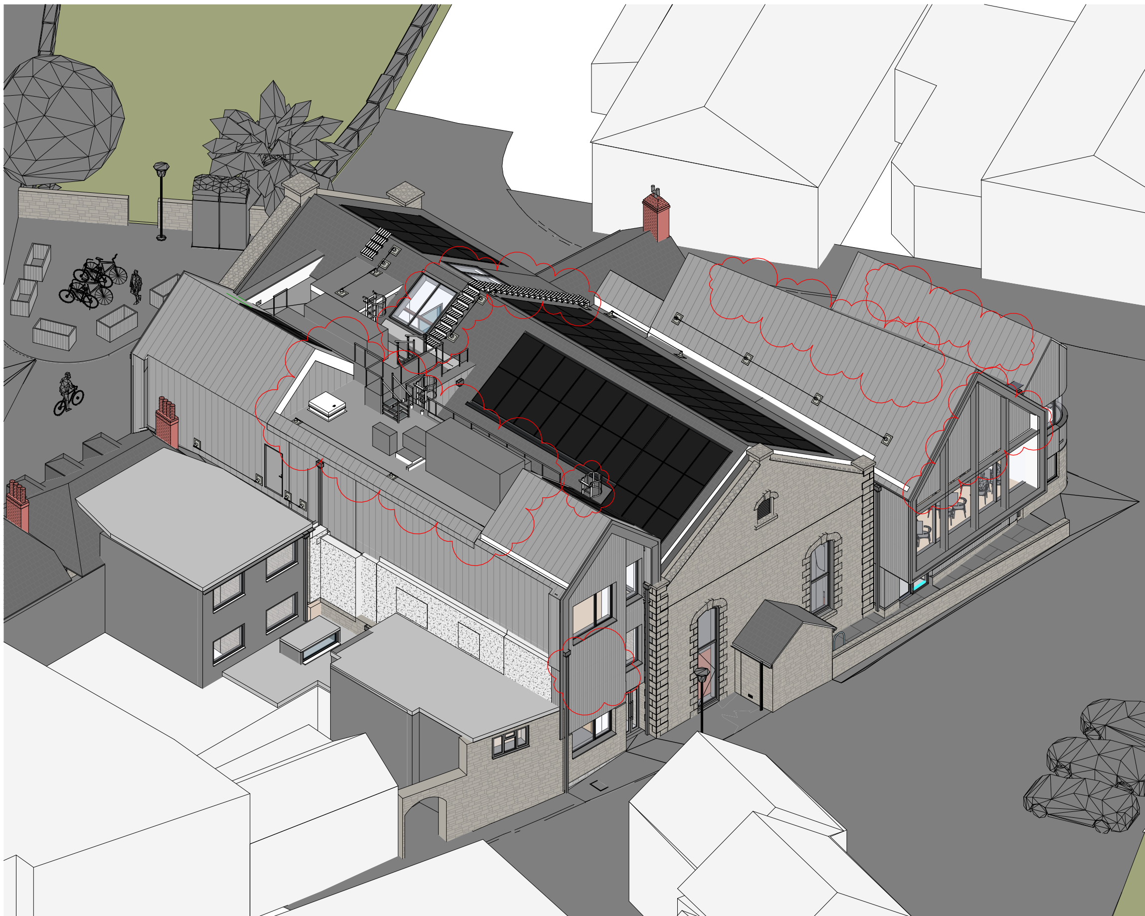
2 South East Axonometric