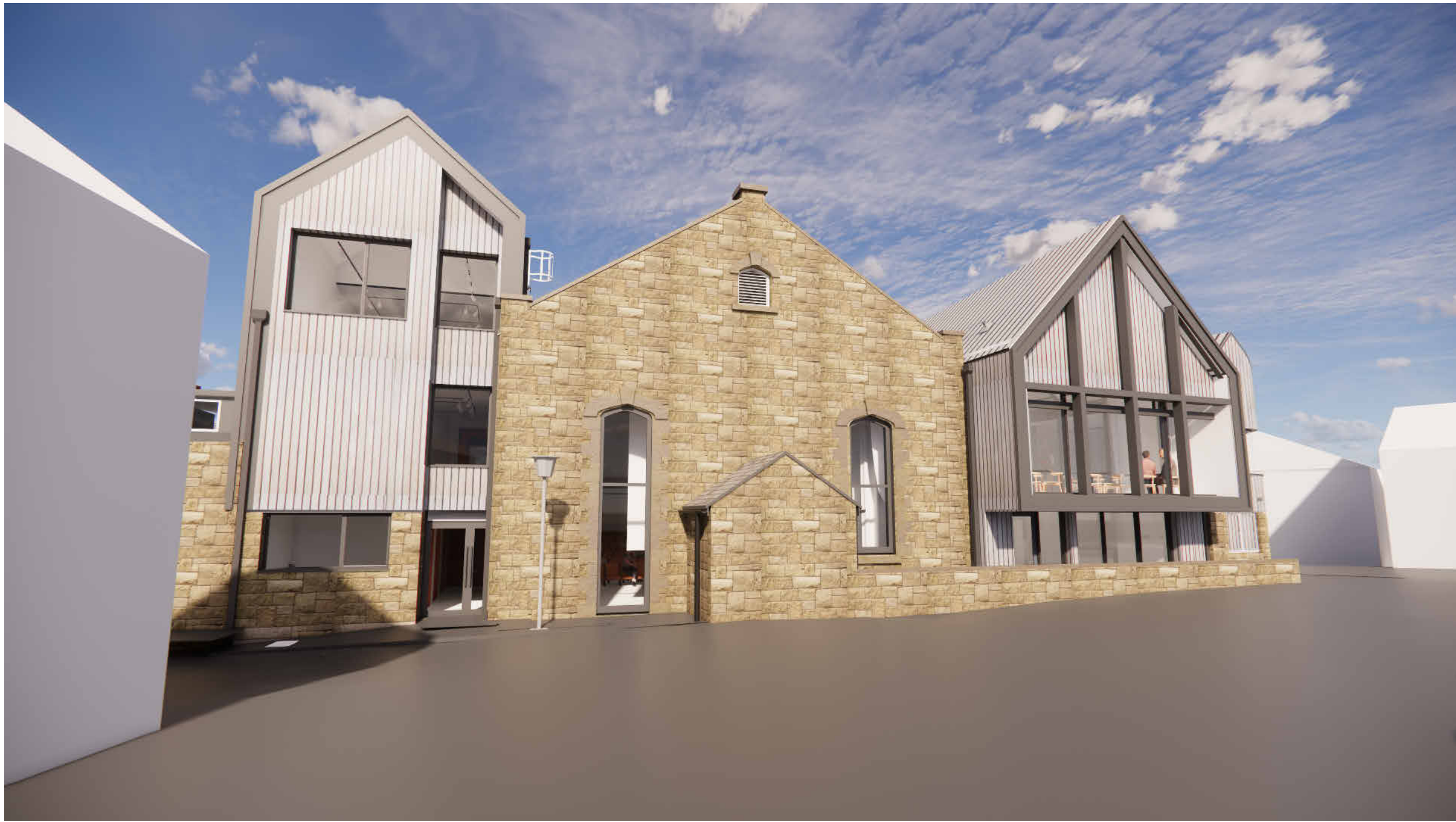
4. View from South West

Notes: Drawings are based on survey data and may not accurately represent what is physically present. Do not scale from this drawing. All dimensions are to be verified on site before proceeding with the work. All dimensions are in millimeters unless noted otherwise. Purcell shall be notified in writing of any discrepancies.