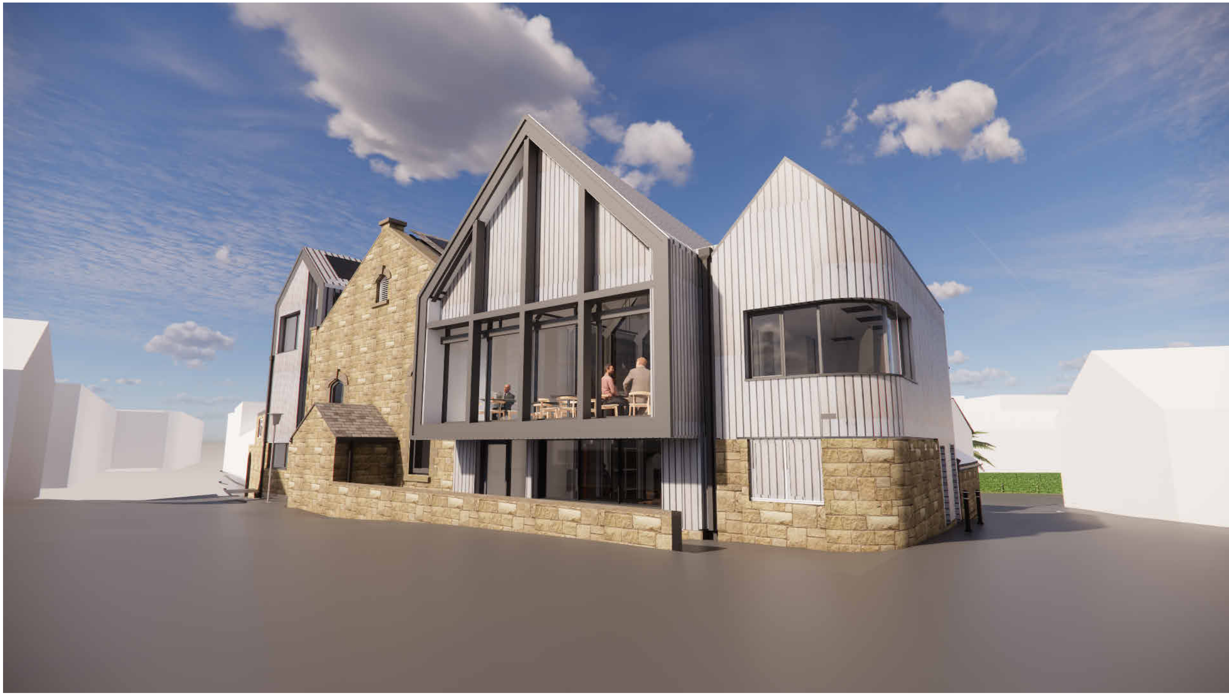
3. View from South East