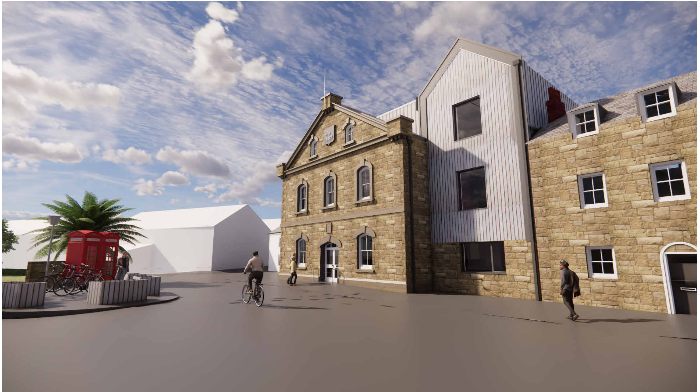
1. View from North West