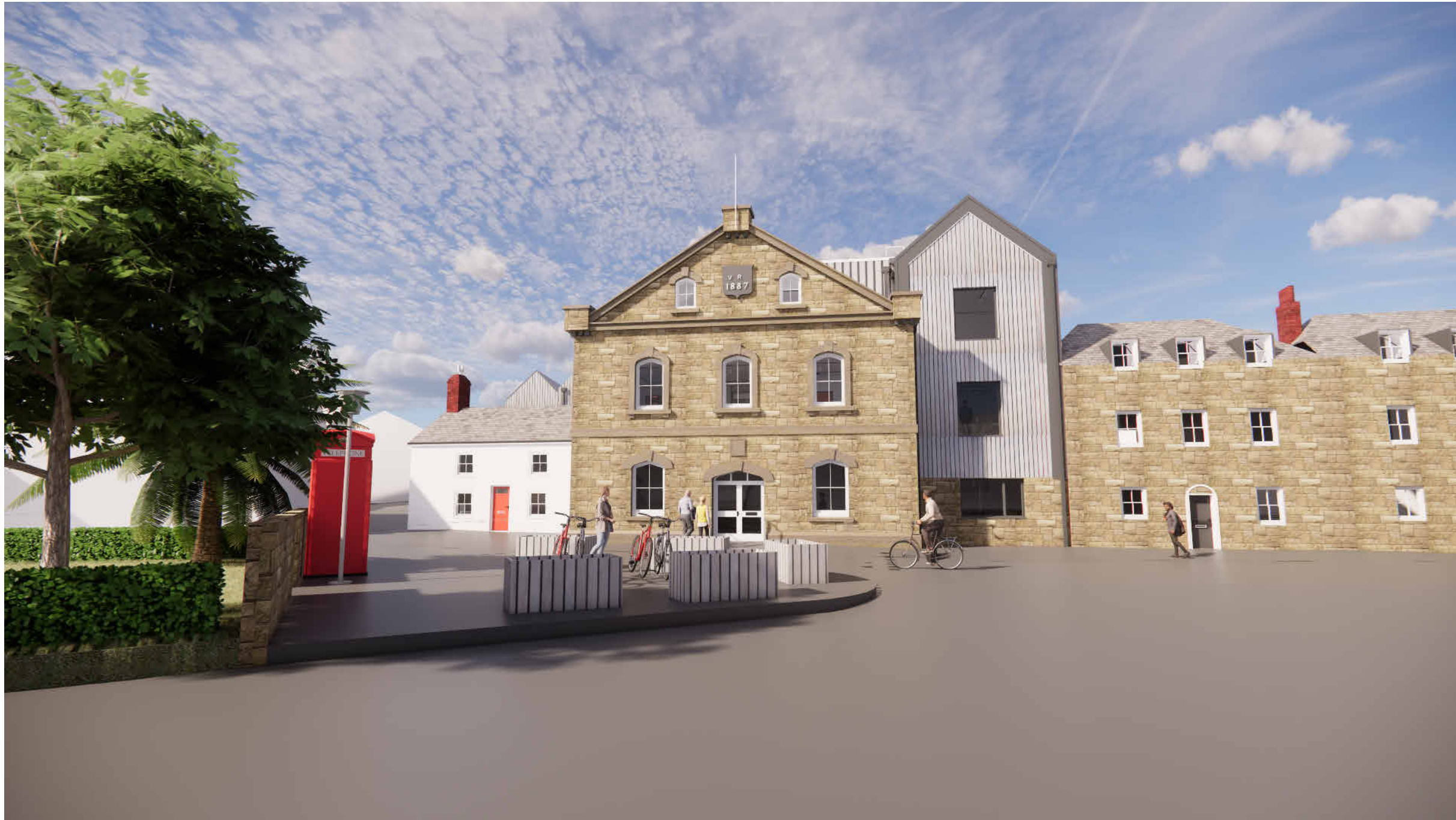
2. View from North near Parade Square