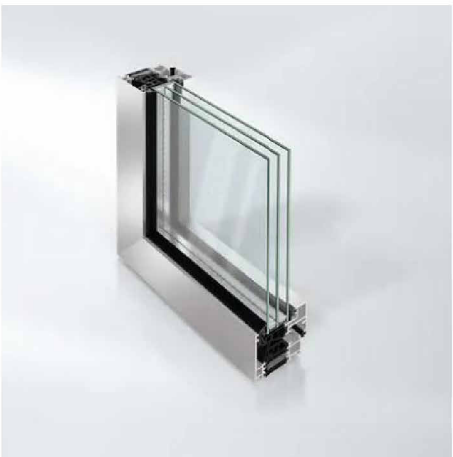
4 Fixed and Side Hung Aluminium Windows - Schuco AWS 70 BS.SI+