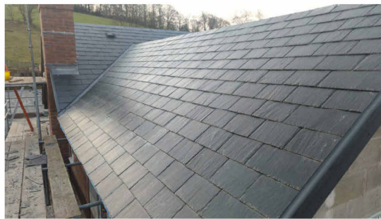
6 Slate Rooding - Riverstone