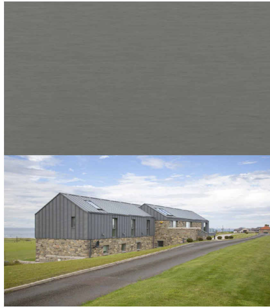
7 Zinc Roof - VM Zinc Quartz-Zinc