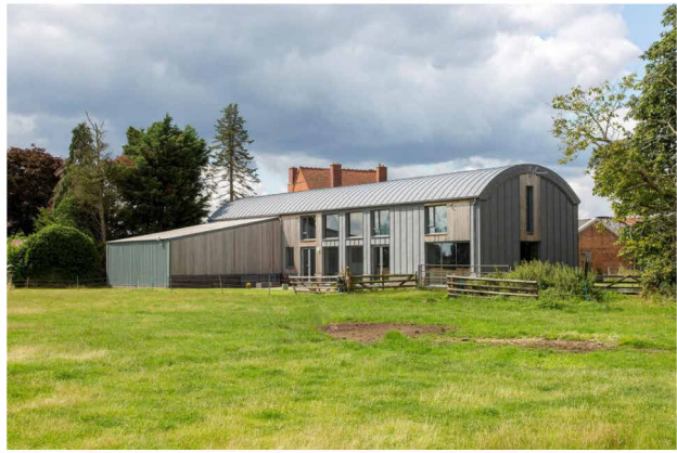
2 Zinc Cladding - VM Zinc