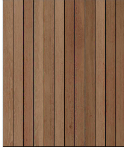
1 Canadian Western Red Cedar Timber Cladding

Purcell Bristol Studio: 6, St Peter's Court, Bedminster, Bristol BS3 4AQ