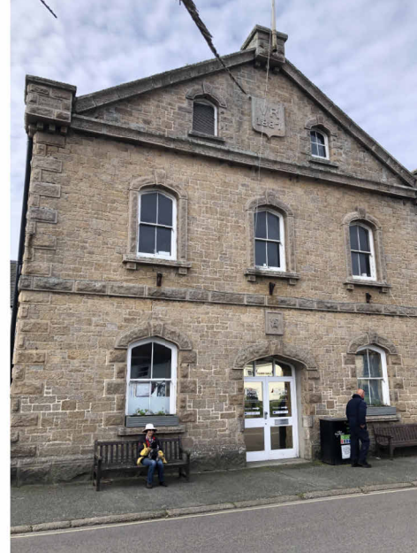
8 Timber sash and case windows