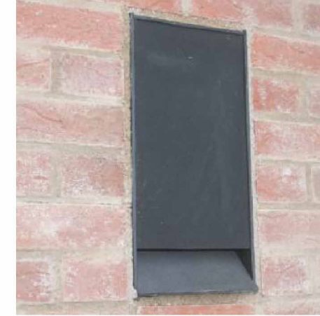
12 Bat boxes in timber weatherboarding - Nestbox Integrated Eco Bat box Crevice Design