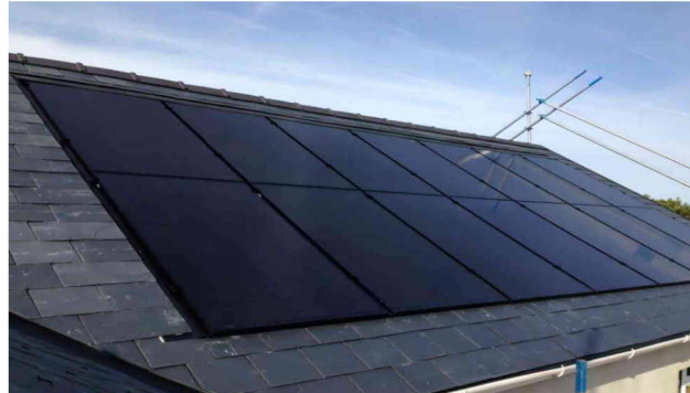
9 Suntech Ultra V mini PV panels