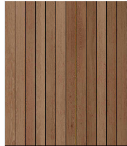
1 Canadian Western Red Cedar Timber Cladding