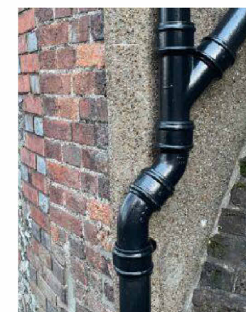
11 Cast Iron Pipework to existing building where required - J&JV Longbottom as Gutters Black