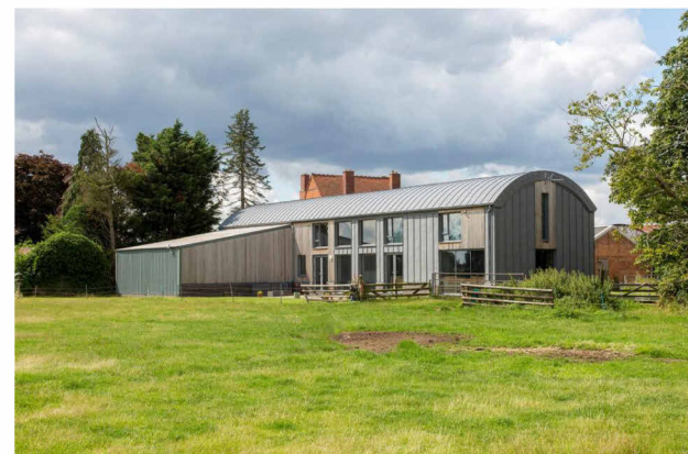
2 Zinc Cladding - VM Zinc