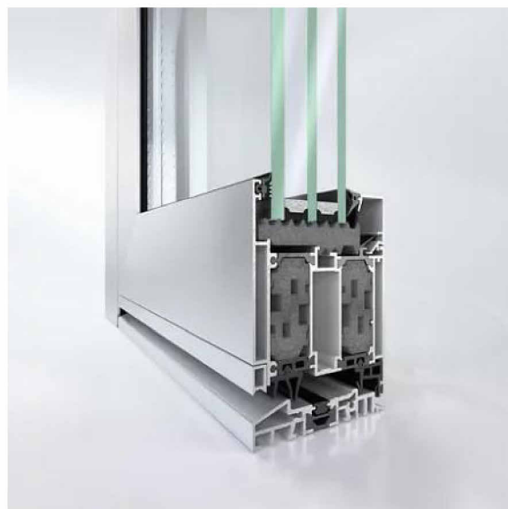
5 External glazed aluminium leaf door set - Schuco AD UP 90 SI