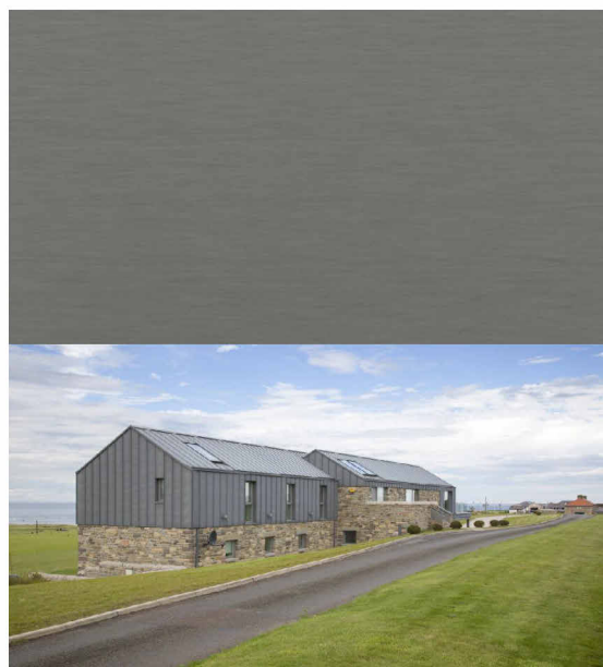
7 Zinc Roof - VM Zinc Quartz-Zinc