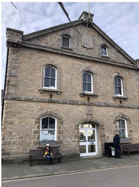
8 Timber sash and case windows