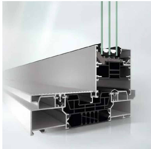
3 Sliding Aluminium Window - Schuco ASE 80.HI