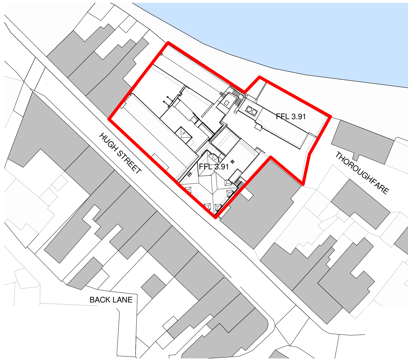
EXISTING BLOCK PLAN 1 : 500