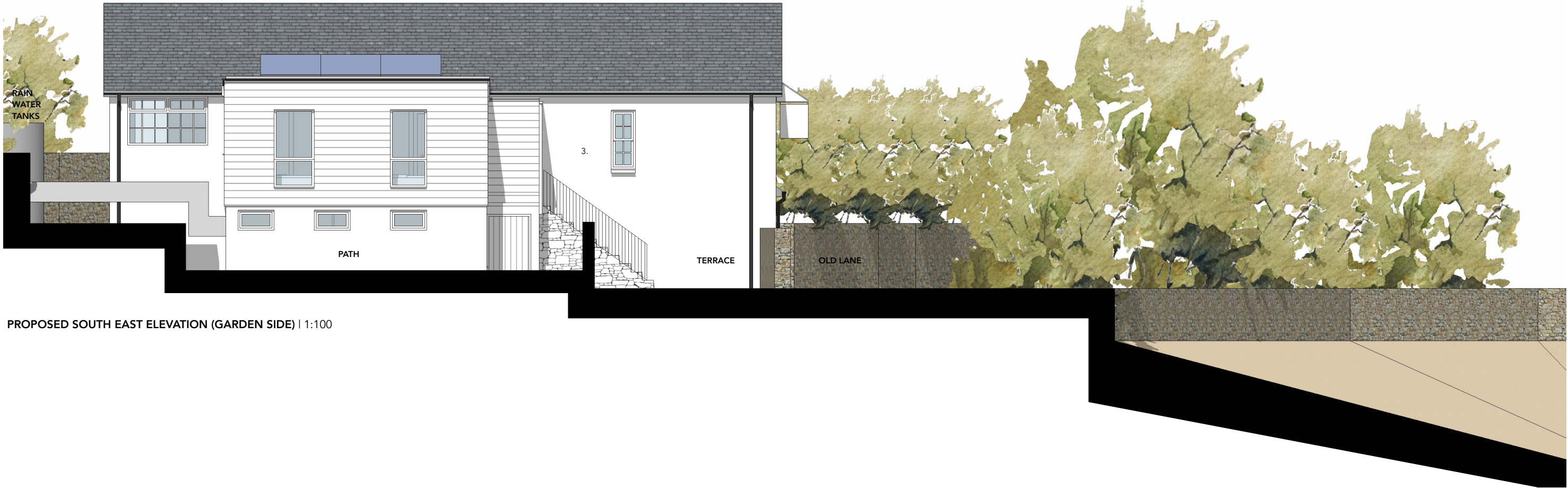
PROPOSED SOUTH EAST ELEVATION (GARDEN SIDE) | 1:100