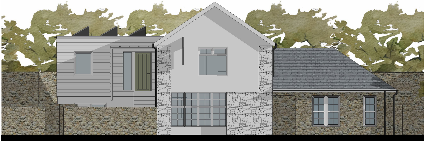
PROPOSED NORTH EAST ELEVATION (ROADSIDE) | 1:100