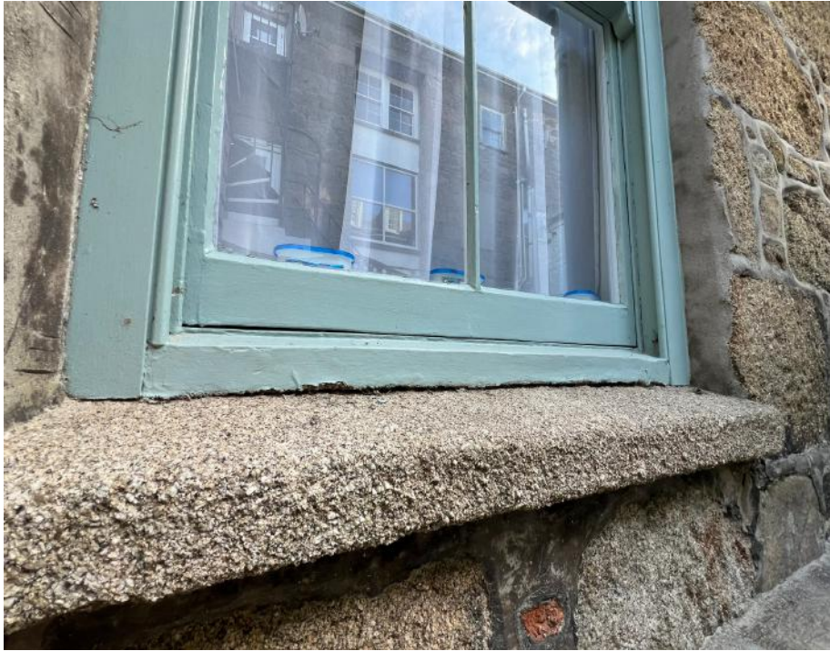
FIGURE 09: W9