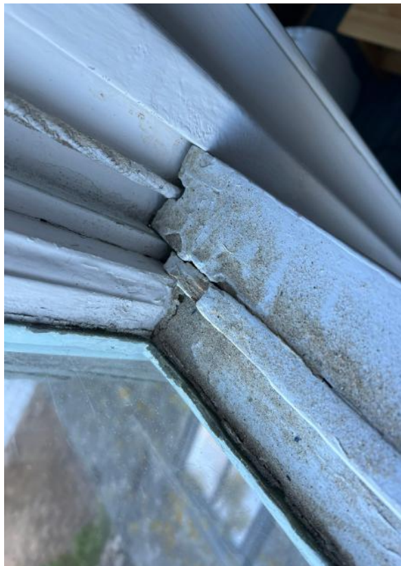
FIGURE 34: W18/19