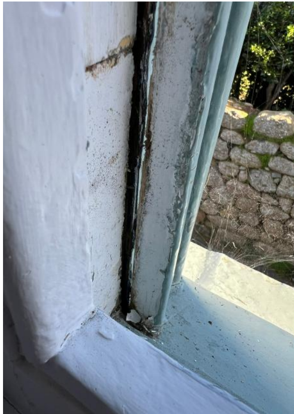
FIGURE 22: W16