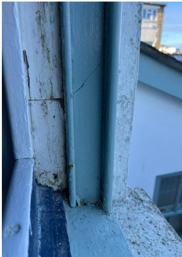
FIGURE 26: W17