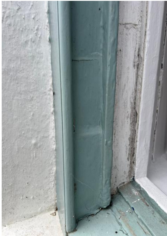
FIGURE 03: W1