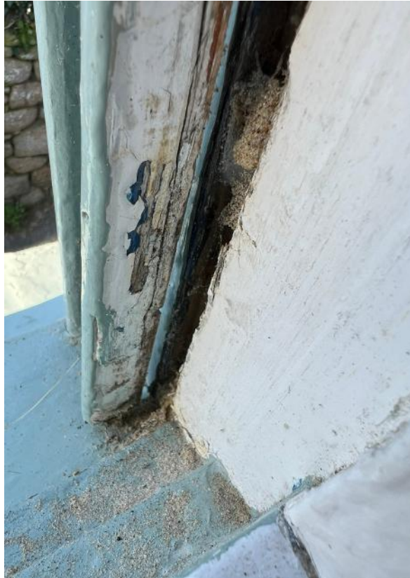
FIGURE 21: W16