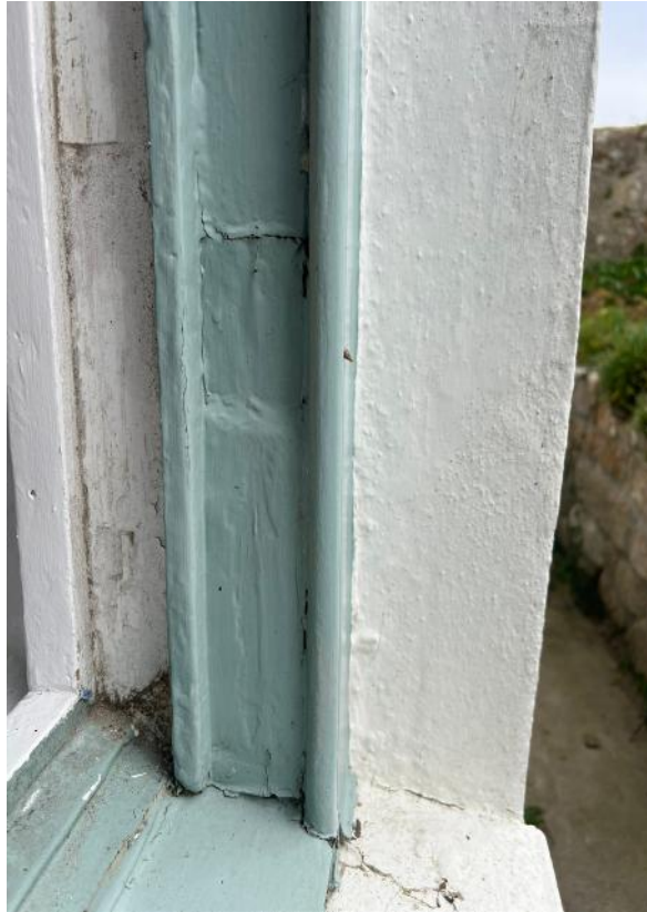
FIGURE 01: W1