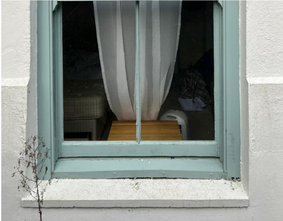
FIGURE 05: W1