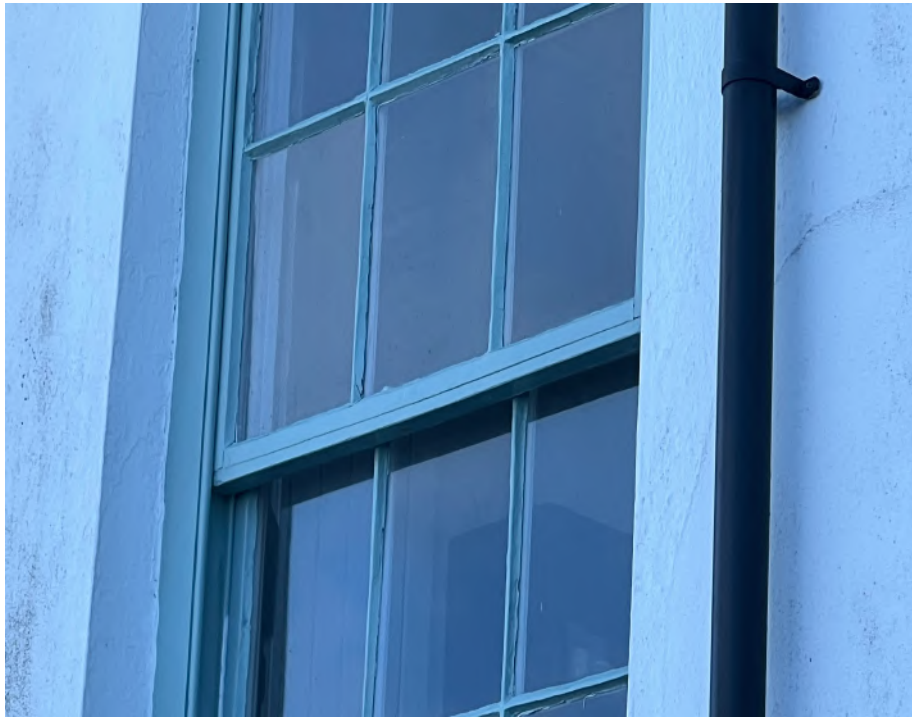
FIGURE 37: W20