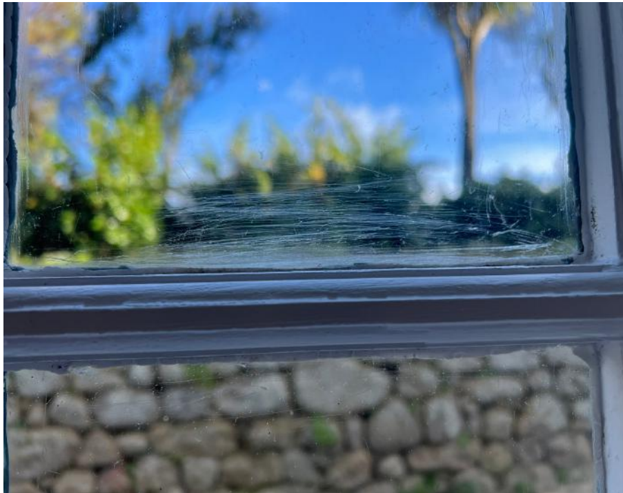
FIGURE 08: W2