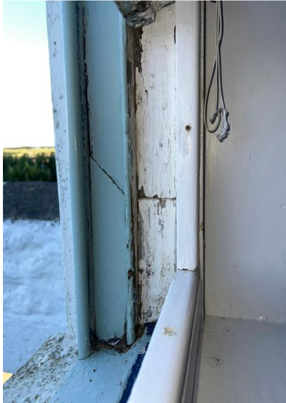
FIGURE 25: W17