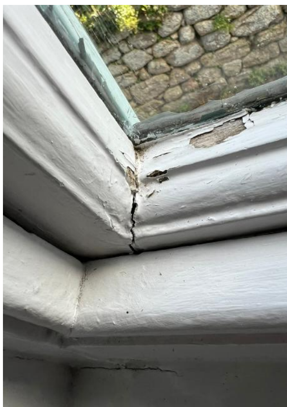
FIGURE 20: W15