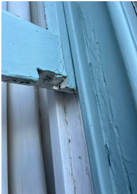
FIGURE 32: W18/19