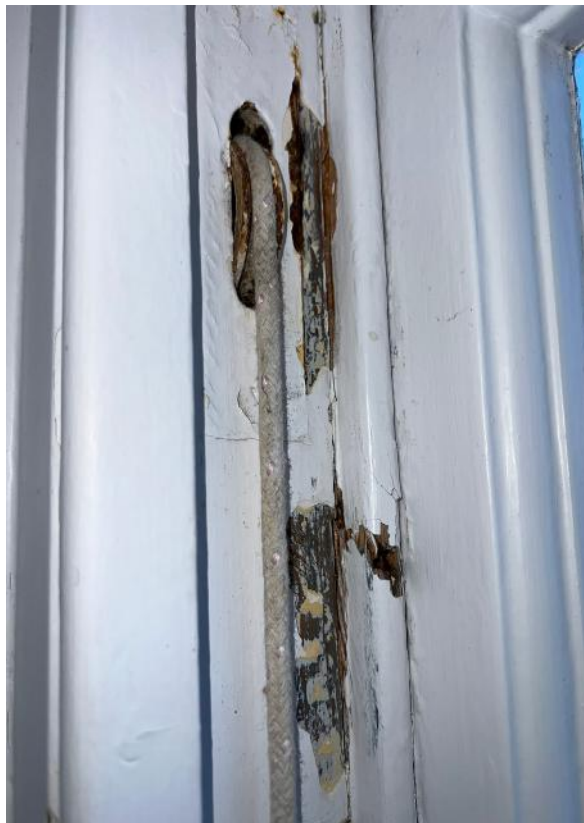
FIGURE 24: W17