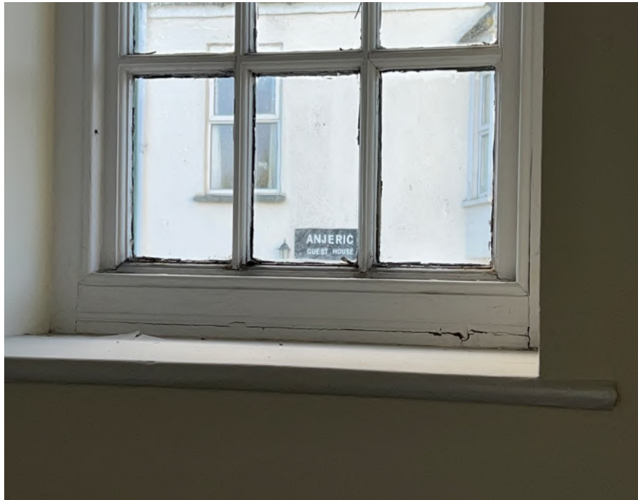
FIGURE 13: W13