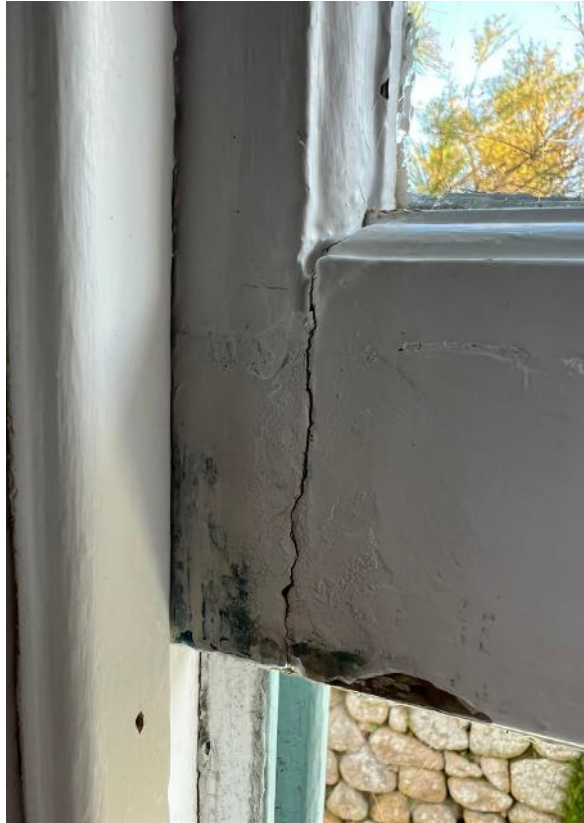
FIGURE 23: W16