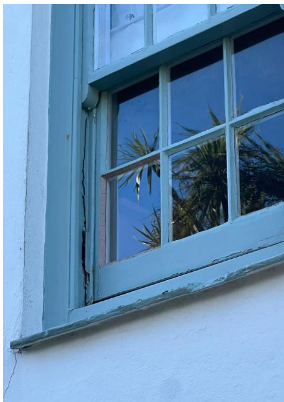
FIGURE 19: W15