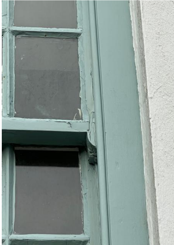
FIGURE 15: W13