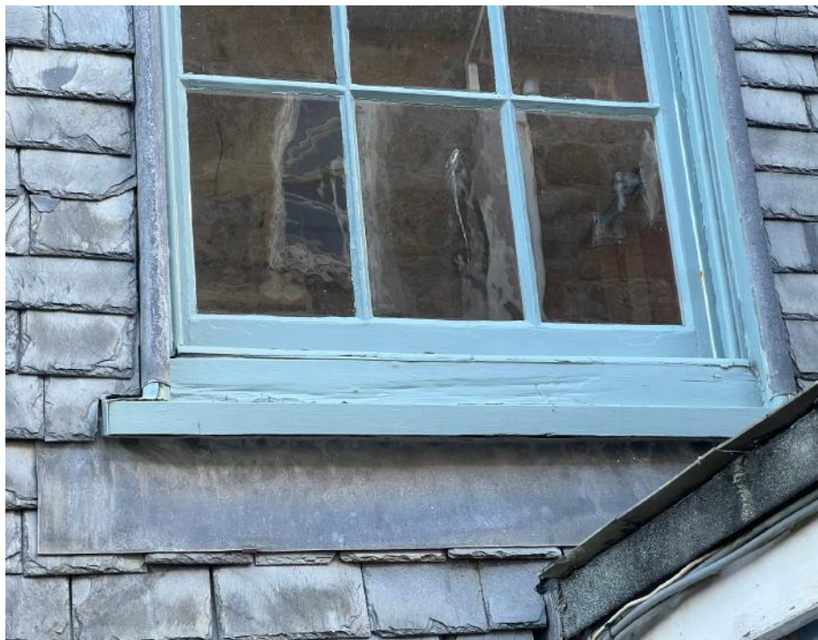
FIGURE 42: W22