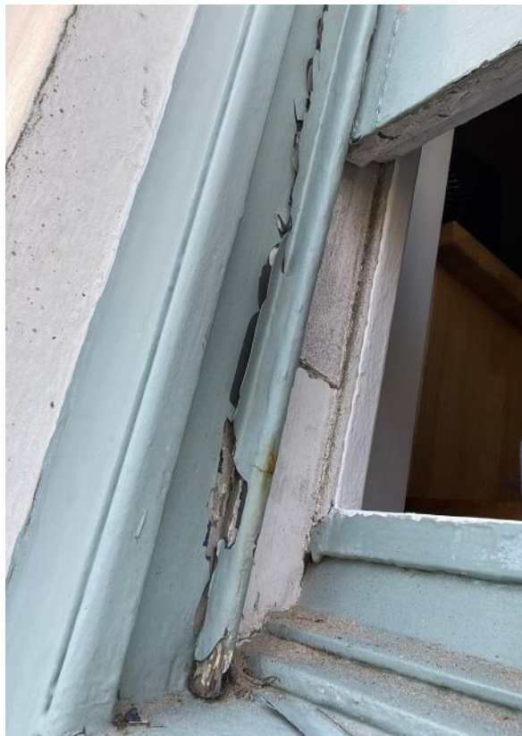
FIGURE 18: W15