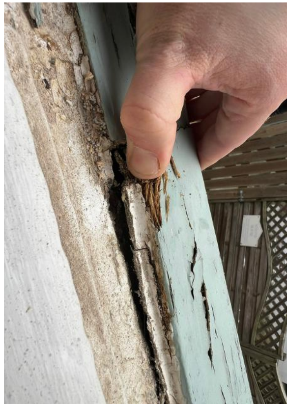
FIGURE 38: W22