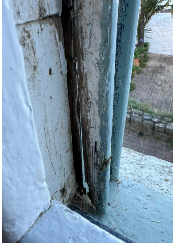
FIGURE 27: W17