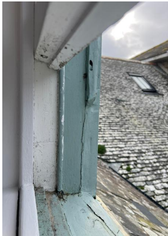
FIGURE 46: W25