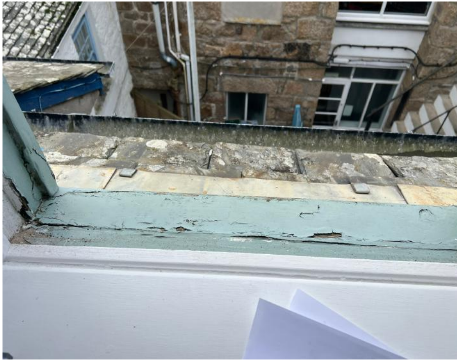
FIGURE 45: W24