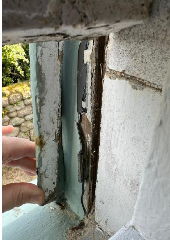
FIGURE 17: W15