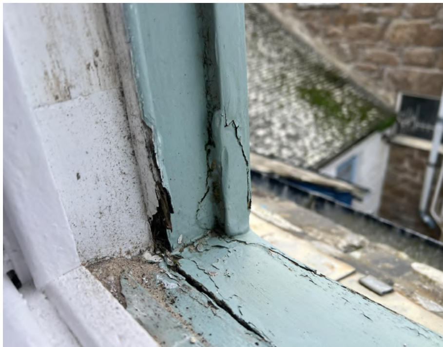
FIGURE 44: W24