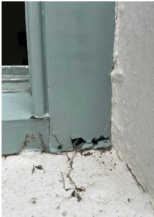
FIGURE 04: W1