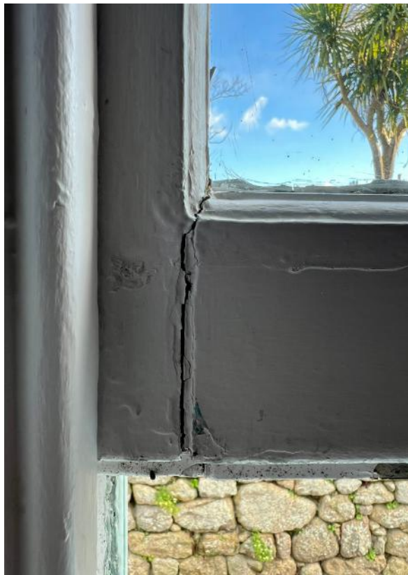
FIGURE 16: W15