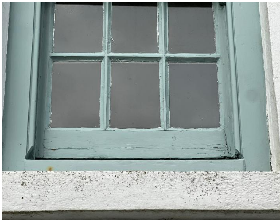
FIGURE 14: W13