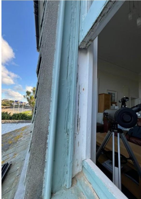
FIGURE 31: W18/19