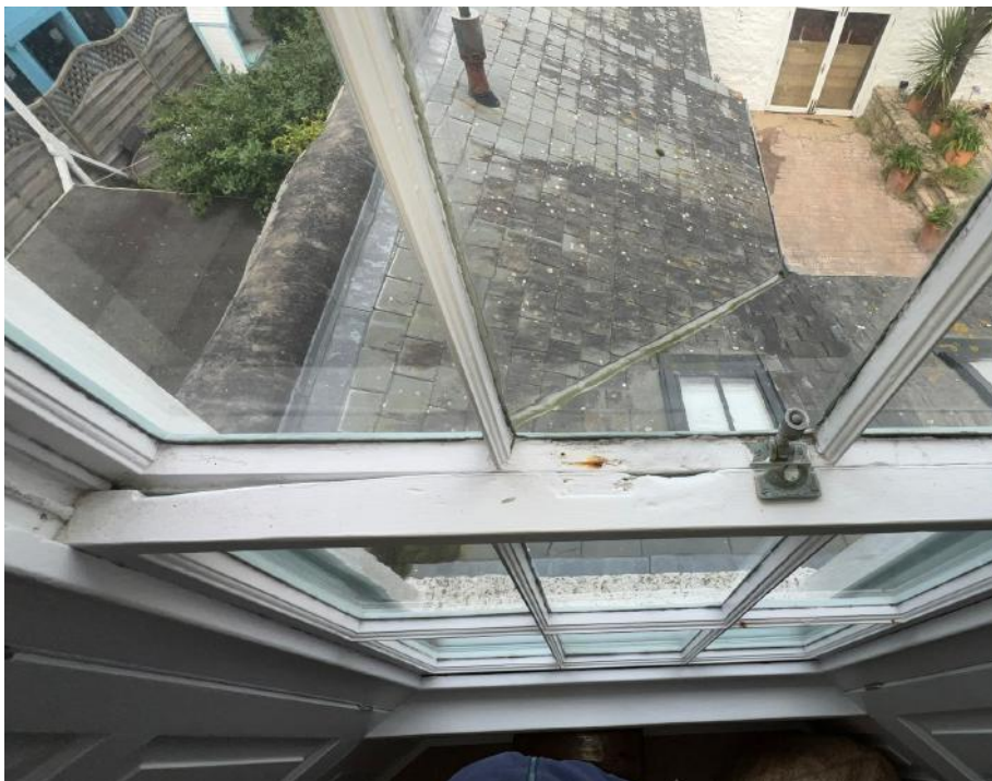
FIGURE 36: W20/21