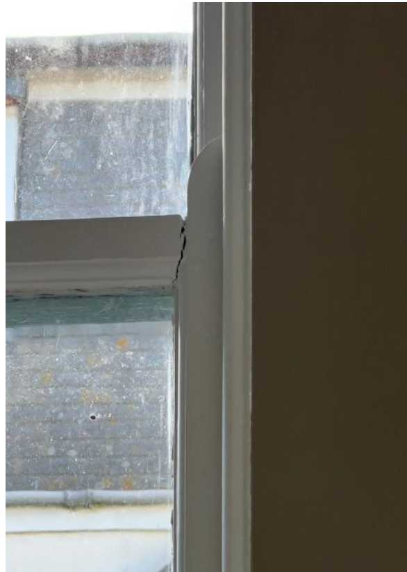
FIGURE 12: W13