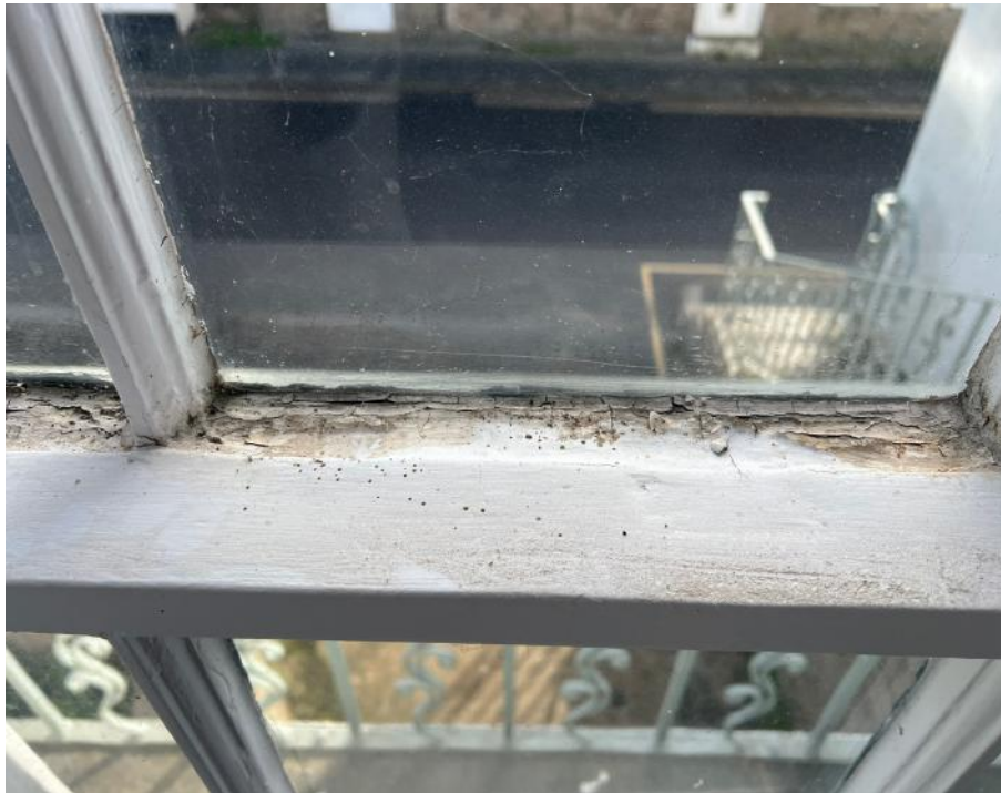
FIGURE 10: W10