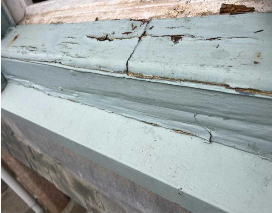
FIGURE 39: W22