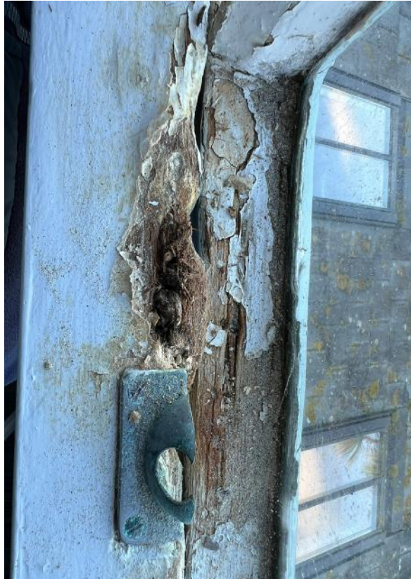
FIGURE 35: W18/19