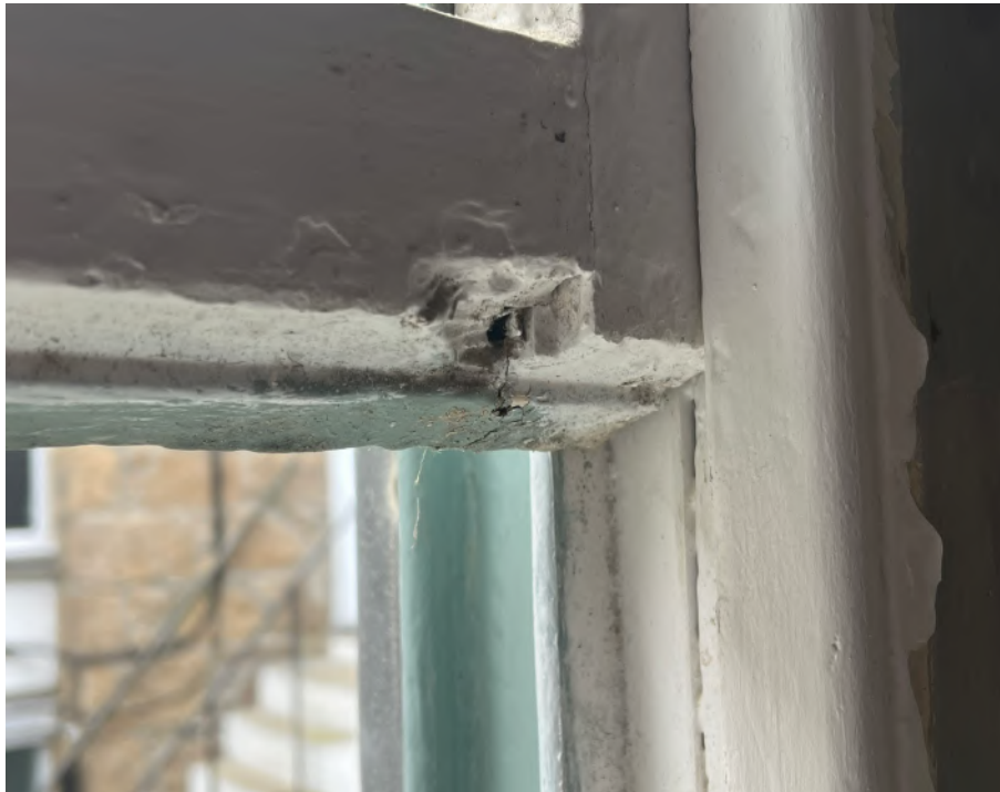
FIGURE 40: W2