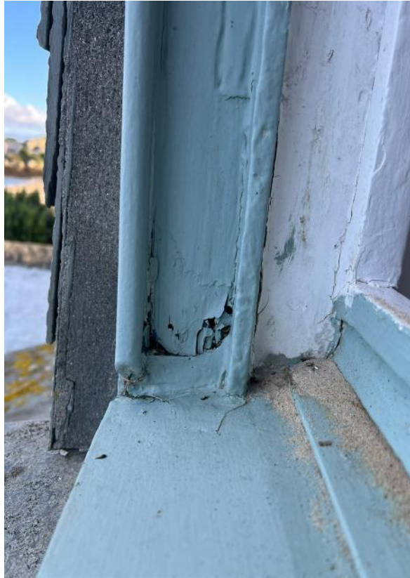
FIGURE 29: W18/19