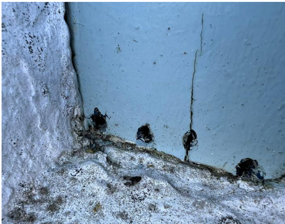
FIGURE 28: W17