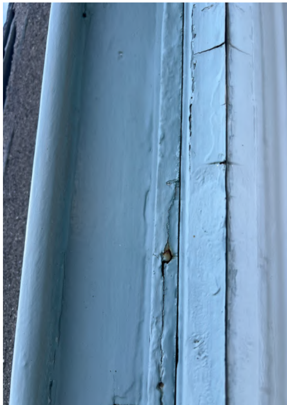
FIGURE 30: W18/19