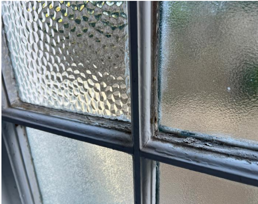
FIGURE 06: W2