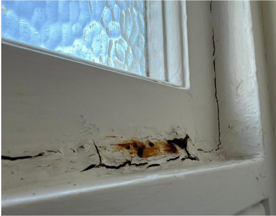
FIGURE 07: W2