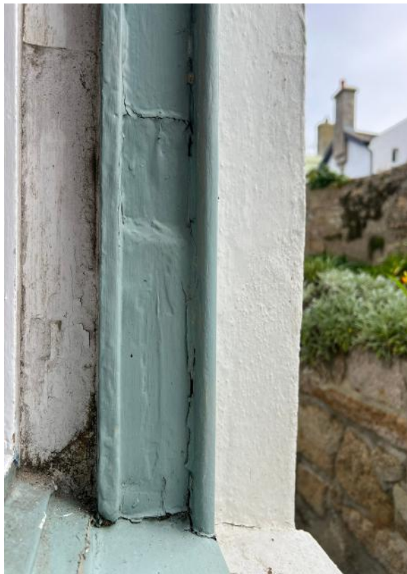
FIGURE 02: W1