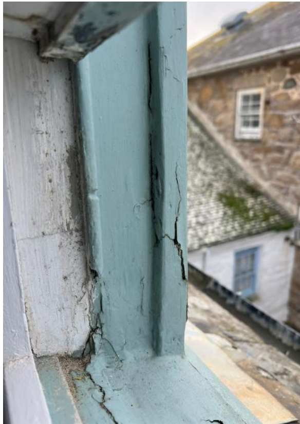
FIGURE 43: W23