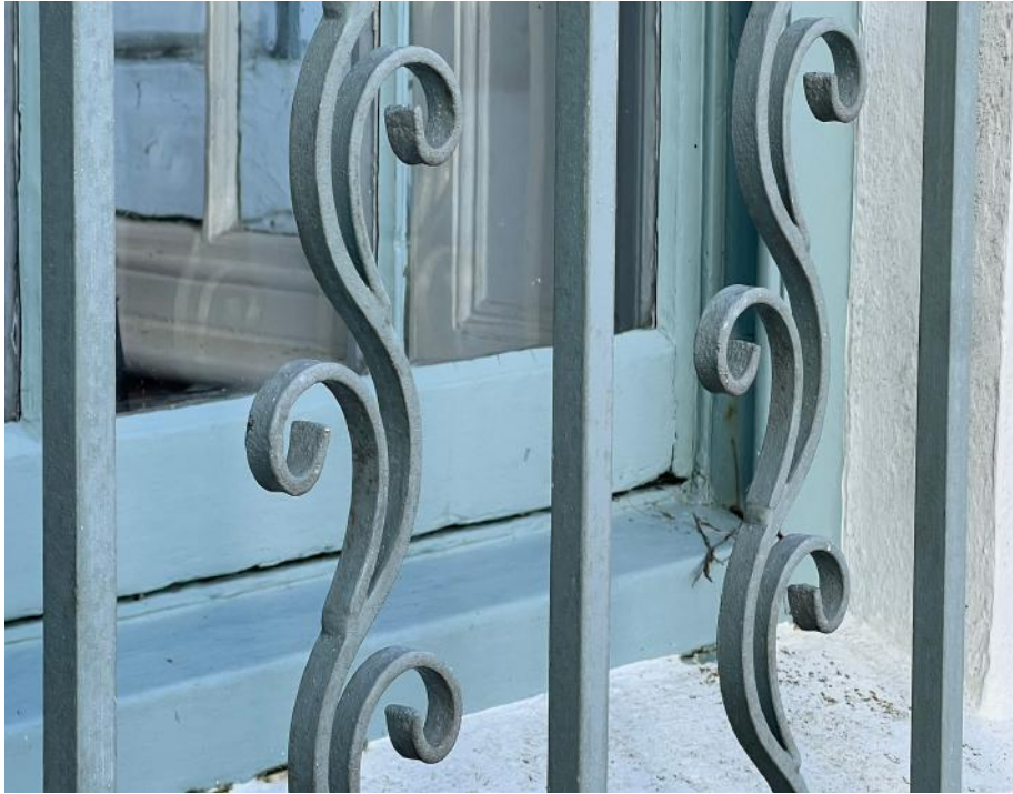
FIGURE 11: W10