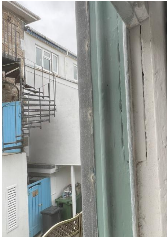
FIGURE 41: W22