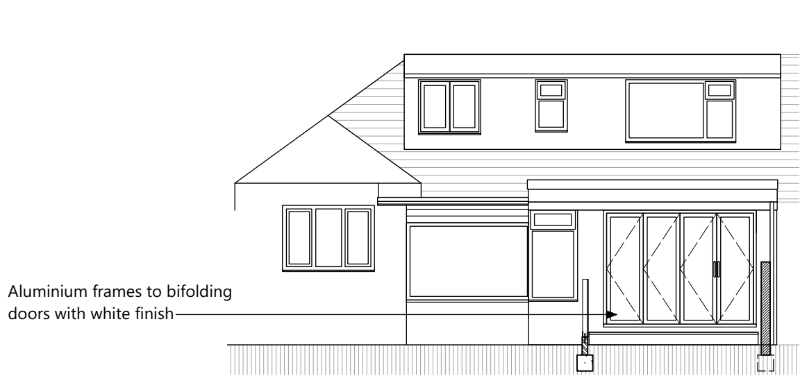
PROPOSED BEACH ELEVATION ( scale 1 : 100 )